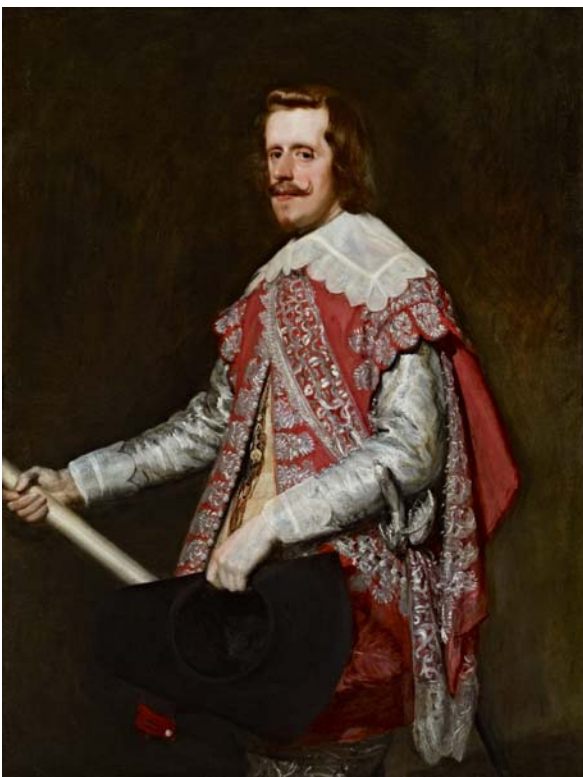
Velázquez, King Philip IV of Spain, 1644, oil on canvas, 51 1/8 x 39 1/8 inches, The Frick Collection