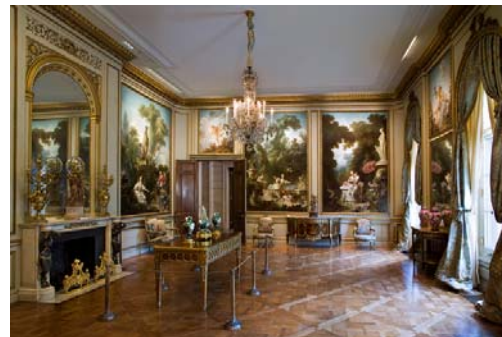
The Fragonard Room, The Frick Collection, New York.