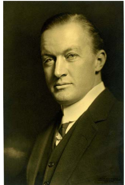
John Russell Pope