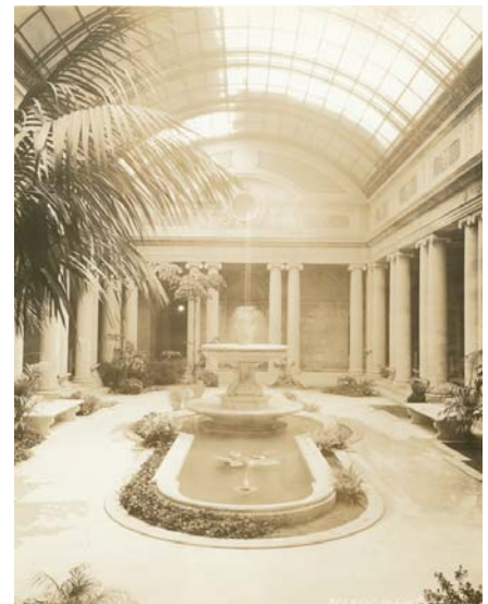
The Garden Court undergoing planting experiments in August 1935 prior its public opening that December.

http://www.frick.org/anniversary for further information and additions to the 2010 celebrations.