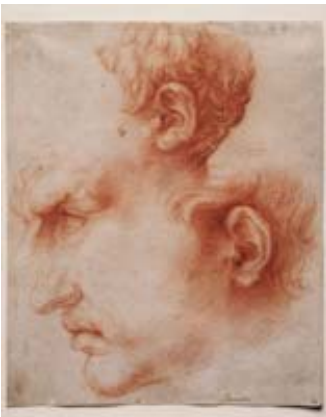
Jusepe de Ribera (1591–1652), Studies of a Head in Profile , c. 1622, Princeton University Art Museum

Unconventional subjects and original treatment of the human form are hallmarks of the work of Jusepe de Ribera, one of Spain’s greatest artists and a brilliant draftsman. Ribera spent most of his career in Naples, then under Spanish rule, supplying religious paintings for his ecclesiastical patrons. While drawing served a vital role in the preparatory stages of his commissioned work, he also used it as a release from the demands of his patrons to vent his prodigious imagination in flights of fantasy and inventive reworkings of the human body. In his unsettling and humorous Head of a Man with Little Figures on His Head (front page), a man with malformed features is depicted bust length in profile, staring vacantly. He seems unaware of the tribe of