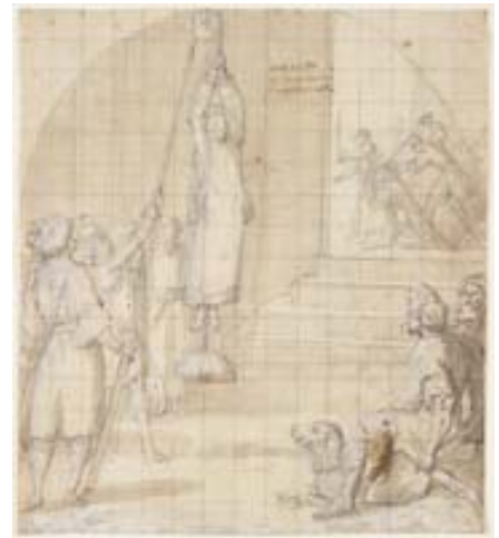
Vicente Carducho (1576–1638), Martyrdom of Father Andrés , c. 1632, The Morgan Library & Museum, New York

An interesting case study is Vicente Carducho’s large drawing, Martyrdom of Father Andrés , one of several preparatory drawings for a series of paintings at the Charterhouse of El Paular commemorating the lives of martyred Carthusian monks. This sheet depicts the torture and death of Father Andrés, who was taken prisoner by the Turks. In the foreground, the saint is hoisted on a pulley by his wrists, while his captors look on dispassionately, swords at the ready. Balanced groups of figures are arranged in a perspectival space, as if on a stage. Gestures and emotions are restrained; the saint appears to be levitating upward even as his body is wrenched downward, arms pulled from their sockets. Here, the artist makes use of aspects of the classical manner of representation to mitigate the directness of the emotional content of the work.