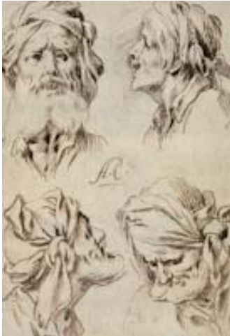
Antonio del Castillo y Saavedra (1616–1668), Four Heads of Men, c. 1660

happy, naked “little men”—who appear in many of Ribera’s drawings—swarming over his Phrygian cap, performing acrobatic feats. One of the most powerful works in this exhibition, Studies of a Head in Profile , (above) demonstrates the extraordinary plasticity of Ribera’s imagination. Forged together in a profile of a man’s head are four separate studies of his features. Ribera pits his powers of formal invention against his mastery of the conventions of naturalistic representation and his virtuoso handling of the red chalk medium, which gives his composite image a startling sense of realism.