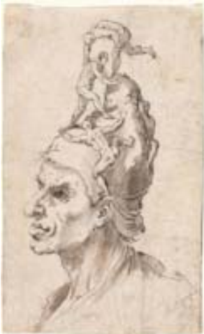
Jusepe de Ribera (1591–1652), Head of a Man with Little Figures on His Head , c. 1630, Philadelphia Museum of Art

ACCOMPANIED LATER IN THE MONTH BY AN EXPLORATION OF THE RECENTLY CLEANED AND STUDIED PORTRAIT OF PHILIP IV BY VELÁZQUEZ