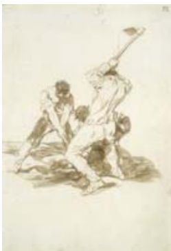
Francisco de Goya y Lucientes (1746–1828), Three Men Digging, c. 1812–20

The Anglers , a drawing in The Frick Collection from Album F, demonstrates Goya’s use of improvisation. He began the drawing on a sheet of paper covered with writing at the top that pertains to a financial matter dating from many years earlier. Goya’s reuse of the sheet was clearly not motivated by wartime shortages of paper, as some have suggested—otherwise he would have used the clean reverse side—but by a desire to spur his imagination with the marking. He dragged his brush down the side of the paper, creating a kind of enclosure or stage on which his actors will appear. From improvisation, we turn to another aspect of Goya’s visual thinking: the working out of a multipart composition. Three Men Digging from Album F, has long been connected with Goya’s oil painting The Forge of 1815–1820 in The Frick Collection. When beginning The Forge , Goya may have looked back through