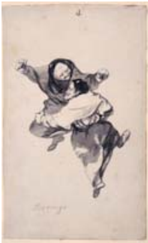
Francisco de Goya y Lucientes (1746–1828), Regozijo (Mirth), (Album D. 4), c. 1816–20

Yet Goya's art was not unremittingly dark. The drawings on view show the many facets of his personality and his keen powers of observation, translated into quick takes rendered with economy and precision. As intrinsic to his worldview are his buoyancy, tenderness, and love of the absurd, revealed in the many drawings in which he invites us to laugh with him at the comédie humaine . This he does in his superbly fluid brush and ink drawing Regozijo (Mirth) , in which an aging pair, castanets in hand, ascend upward, carried away by music and their levity, and the rhythms of Goya's hand. As compared with the art of his predecessors, Goya's is more unencumbered and direct—more modern. Yet in ways that may not have been fully appreciated until his drawings could be seen within the context of those of his compatriots, as they are here, it is also a distillation of a particularly fertile, inventive, and original form of draftsmanship that developed on the Iberian Peninsula, the Spanish manner.