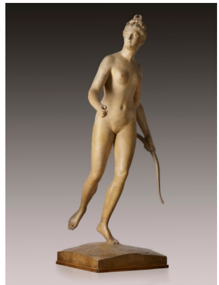
Jean-Antoine Houdon, Diana the Huntress , 1776-1795, terracotta, 75 1/2 inches, The Frick Collection, New York

During this period Frick also drew up his will, which provides for The Frick Collection. Written as a statement of purpose rather than a restrictive set of rules, the Frick’s charter permitted the Board of Trustees to augment his collection. That body included daughter Helen Clay Frick, whose life’s purpose was shaped by her interest in art and who played a strong role in making future museum acquisitions. Helen selectively followed her father’s lead, matching the quality and grandeur of his best purchases across all media. She became deeply engaged by the work of eighteenth-century French artists, training herself to become a respected Houdon specialist. In 1935, she proposed for acquisition the artist’s magnificent life-sized portrait bust of Armand-Thomas Hue, fourth Marquis de Miromesnil, which was displayed in the Garden Court on the occasion of the museum’s opening. In 1939, she instigated the purchase of Houdon’s life-sized terracotta Diana the Huntress , now perhaps the sculpture best identified with The Frick Collection’s holdings, and destined for the new portico gallery.