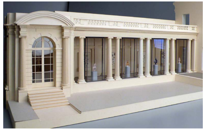
Model of the Portico for Decorative Arts and Sculpture, south façade, by Davis Brody Bond Aedas Architects and Planners