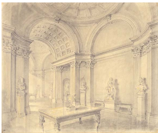
Thomas Hastings's 1916 drawing of a proposed sculpture gallery

Although initially designed with a great paintings collection in mind, the house of Henry Clay Frick would soon be filled with sculpture and decorative arts objects of comparable price and importance. In 1916, the mansion's Drawing Room was transformed into the fully furnished Fragonard Room featuring the artist's Progress of Love series, and Mrs. Frick's upstairs boudoir was subsequently redecorated and fitted with eighteenth-century painted panels, furniture, and porcelains (shown together today in the first floor Boucher Room). Within less than a year of those alterations, Mr. Frick's office was remodeled to display enamels purchased from the estate of J. P. Morgan. While Frick's attraction to Old Master paintings had not waned—fine works by Titian, Hals, Vermeer, and Gainsborough also entered his collection during this period—his taste had broadened to include sculpture as well as a range of decorative arts. His property had expanded as well; in 1915 Frick purchased the adjoining property, a fifty-foot plot at 6-8 East 71 st Street, and authorized his architect, Thomas Hastings, to draw