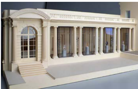
Model of the Portico Gallery for Decorative Arts and Sculpture, south façade, by Davis Brody Bond, architects and planners for the project

On December 13, visitors to The Frick Collection will be able to enjoy a new gallery—the first major addition to the museum's display spaces in nearly thirty-five years. The inspiration for this initiative, which involves the enclosure of the portico in the Fifth Avenue Garden, comes from the intention of museum founder Henry Clay Frick (1849–1919) to build an addition to his 1914 mansion for his growing Collection of sculpture. The project was postponed in 1917 following the United States entry into World War I, and Mr. Frick died before it could be resumed. In recent years, the institution has placed greater focus on sculpture through critically acclaimed exhibitions and several key acquisitions, while also evaluating the effectiveness of the display and lighting of such objects. Another area of increased focus has been the