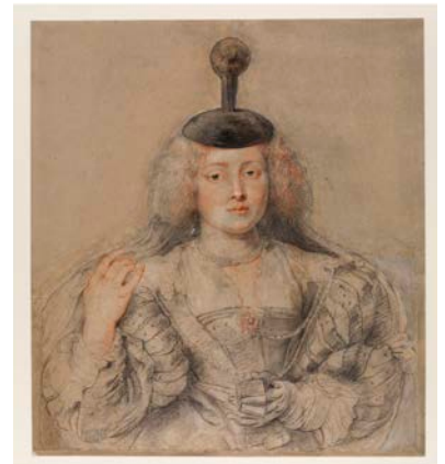
Peter Paul Rubens (1577–1640), Helena Fourment , c. 1630, black, red, and white chalk and pen and ink, 24 x 21 ½ inches; The Courtauld Gallery (Samuel Courtauld Trust)

In keeping with its tradition of exhibiting masterworks from collections outside of New York, the Frick will present fifty-eight drawings from The Courtauld Gallery, London. This exhibition marks the first time that so many of the principal drawings in The Courtauld's renowned collection—one of Britain's most important—have been made available for loan. The prized sheets represent a survey of the extraordinary draftsmanship of Italian, Dutch, Flemish, German, Spanish, British, and French artists active between the late Middle Ages and the early twentieth century. The survey features works executed in a range of drawing techniques and styles and for a variety of purposes, including preliminary sketches, practice studies, aide-mémoires , designs for other artworks, and finished pictures meant to be appreciated as independent works of art. Among the artists in the Frick's exhibition will be Andrea Mantegna, Leonardo da Vinci, Albrecht Dürer, Michelangelo Buonarroti, Peter Paul Rubens, Jusepe de Ribera, Rembrandt Harmensz van Rijn, Jean-Antoine Watteau, Charles-Joseph Natoire, Thomas Gainsborough, Francisco Goya y Lucientes, Joseph Mallord William Turner, Théodore Géricault, Edgar Degas, Paul Cézanne, Vincent van Gogh, Georges Seurat, Henri Matisse, and Pablo Picasso.