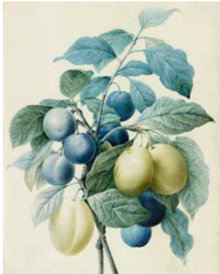
Pierre-Joseph Redouté (1759–1840), Plum Branches Intertwined , 1802–4, watercolor on vellum, 12 ½ x 10 1/3 inches, The Frick Collection, bequest of Charles Ryskamp

February 14, 2012, through April 8, 2012