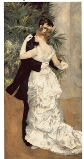
Pierre-Auguste Renoir (1841–1919), Dance in the City (La Danse à la ville) , 1883, oil on canvas, 71 x 35 ½ inches, Musée d'Orsay, Paris (Galerie du Jeu de Paume)

Renoir, Impressionism, and Full-Length Painting will offer fresh insights into Renoir's complex ambitions, when as a young artist, he submitted works to both the avant-garde Impressionist exhibitions and the official Salon. While painting in the new Impressionist style, Renoir remained uniquely committed to the full-length format—a traditional type eschewed by most of his fellow Impressionists. The exhibition and its accompanying catalogue will draw on contemporary criticism, literature, and archival documents to explore the motivation behind Renoir's full-length figure paintings as well as their reception by critics, peers, and the public. Technical studies of the canvases themselves will also shed new light on the artist's working methods. The juxtaposition of the full-length works of women will bring the glamour of the Belle Époque vividly to life. This format, which bears striking similarities to contemporary fashion plates, afforded Renoir the perfect opportunity to devote himself not only to his sitters, but to the finest details of their dress. The exhibition and accompanying catalogue explore the rich variety of Renoir's painterly technique—the sheer virtuosity of his brushwork in creating silk, lace, mink, and taffeta—as well as the social significance of the garments themselves. From shimmering ball gowns to sumptuous furs, from chic Parisian day dresses to glamorous theatrical costumes, the paintings capture the fashions of Renoir's Paris.