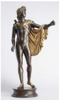
Pier Jacopo Alari Bonacolsi, called Antico (c. 1460–1528), Apollo Belvedere , c. 1490, copper with partial fire gilding and silvering; base of bronze, 16 ¼ inches without base, Liebieghaus Skulpturensammlung, Frankfurt

Antico: The Golden Age of Renaissance Bronzes is the first monographic exhibition in the United States dedicated to Jacopo Alari Bonacolsi, known as Antico (c. 1455–1528). As sculptor to the Gonzaga courts at Mantua and in northern Italy, Antico earned his name, “the antique one,” for his creation in the classical style of statuettes, reliefs, and busts that are distinguished by their opulence and beauty. Using inventive and highly refined techniques, Antico lavishly gilded, silvered, and patinated his works, elevating his bronze sculptures to the status of the ancient precious objects that were avidly collected by his Gonzaga patrons. Splendid and timeless, Antico's works represent a sophisticated court style and have always been exclusive and rare. Today fewer than fifty of his bronzes are known. Dispersed among museums in Europe and America, almost thirty-five of them will come together in this unprecedented presentation.