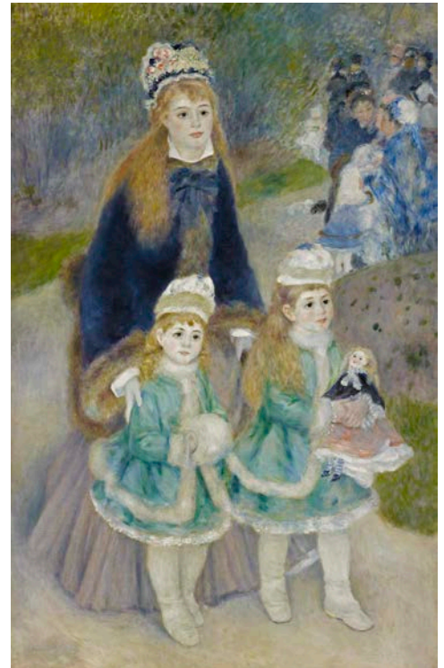
Pierre-Auguste Renoir (1841–1919), La Promenade , c. 1875–76, oil on canvas, 67 x 42 3/4 inches, The Frick Collection, New York, Photo: Michael Bodycomb

October 2, 2012, through January 27, 2013