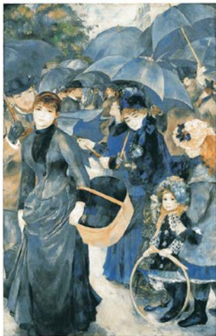
Pierre-Auguste Renoir (1841–1919), The Umbrellas , c. 1881 and 1885, oil on canvas, 71 x 45 inches, The National Gallery, London