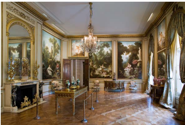
The Fragonard Room as presented today at The Frick Collection, New York

Jean-Honoré Fragonard (1732–1806) was commissioned in 1771 to complete four large canvases for the comtesse du Barry, the consort of Louis XV. They were installed in 1772 in the pavilion in Louveciennes built for her outside of Paris by the king. By 1773 the canvases— The Pursuit , The Meeting , The Lover Crowned , and Love Letters —had been rejected by Du Barry and returned to the artist. In 1790,