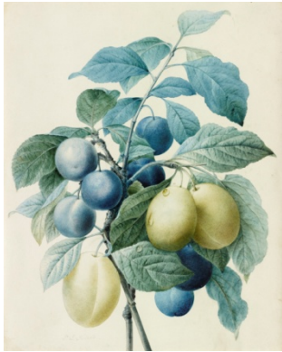
Pierre-Joseph Redouté (1759–1840) Plum Branches Intertwined , 1802–4