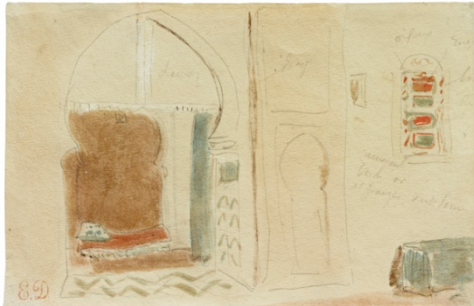
Eugène Delacroix (1798–1863)