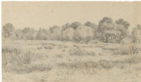
Pierre-Étienne-Théodore Rousseau (1812–1867)