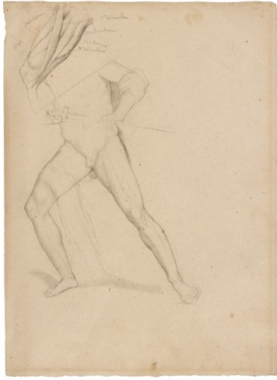
Hilaire Germain Edgar Degas (1834–1917) Study of a Male Nude with a Sword , c. 1856–59 Graphite on dyed rose paper 28 x 20.5 cm The Frick Collection, bequest of Charles A. Ryskamp, 2010