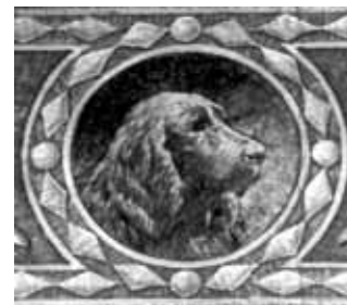
Lealtà - Loyalty