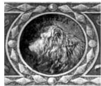
Fedeltà - Fidelity