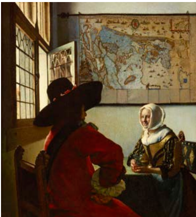
Johannes Vermeer (1632–1675) Officer and Laughing Girl, ca. 1657 Oil on canvas 19 7/8 x 18 1/8 inches The Frick Collection, New York