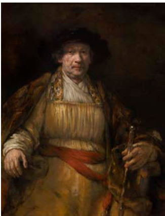
Rembrandt Harmensz. van Rijn (1606–1669) Self-Portrait , 1658 Oil on canvas 52 5/8 x 40 7/8 inches The Frick Collection, New York