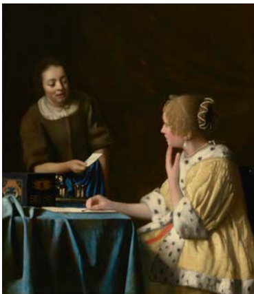
Johannes Vermeer (1632–1675) Mistress and Maid, ca. 1666–67 Oil on canvas 35 1/2 x 31 inches The Frick Collection, New York