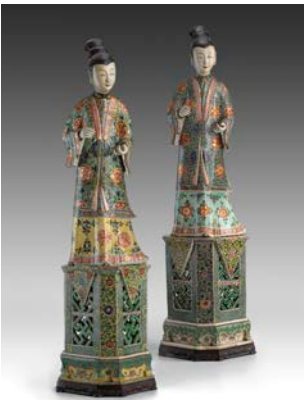
Chinese, Qing Dynasty (1644–1911) Two Figures of Ladies on Stands , 18th century Hard-paste porcelain with polychrome overglaze 38 × 10 1/4 × 10 1/4 inches The Frick Collection, New York