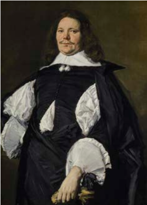
Frans Hals (ca. 1581–1666) Portrait of a Man , ca. 1660 Oil on canvas 44 1/2 x 32 1/4 inches The Frick Collection, New York