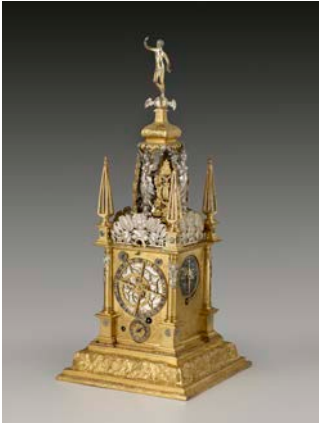
David Weber (act. 1623/24–1704) Table Clock with Astronomical and Calendrical Dials , probably 1653 Gilt brass and silver 23 3/8 x 10 1/16 x 9 7/8 inches Bequest of Winthrop Kellogg Edey, 1999 The Frick Collection, New York