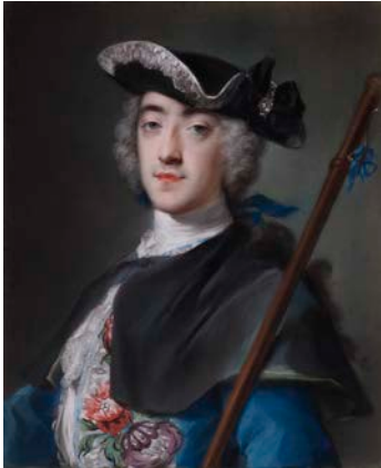
Rosalba Carriera, (1673–1757) Portrait of a Man in Pilgrim's Costume , ca. 1730–50 Pastel on paper 31 1/2 x 27 x 3 1/4 inches Gift of Alexis Gregory, 2020 The Frick Collection, New York