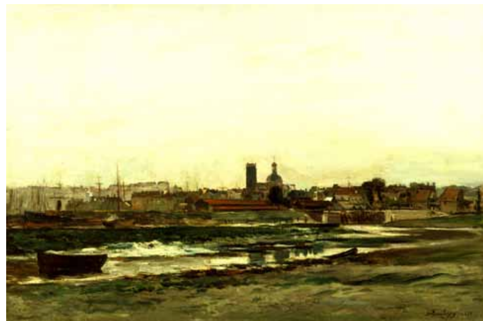
RIGHT Charles-François Daubigny (1817–1878), Dieppe , 1877, oil on canvas, The Frick Collection

a view not of scenic beaches and grand ships, but of rough-hewn buildings and small fishing boats. Masts rise throughout the composition and tiny figures—probably fishermen—appear on the shore. The two women in the foreground wear the head-dresses, billowing skirts, and clogs typical of the residents of Le Pollet, a fishing community on the harbor's eastern shore that was characterized in literature of the period as a simple, pre-industrialized society, timeless in its dress and customs. The women's presence in this calm scene is akin to that of the villagers and farmers in many landscapes of the Barbizon School and particularly to the laundresses in the rural views of Charles-François Daubigny, Vollon's close friend and mentor. They represent the quotidian life of the harbor and play an important, if subtle, role in the artist's overall evocation of the atmosphere of the place.