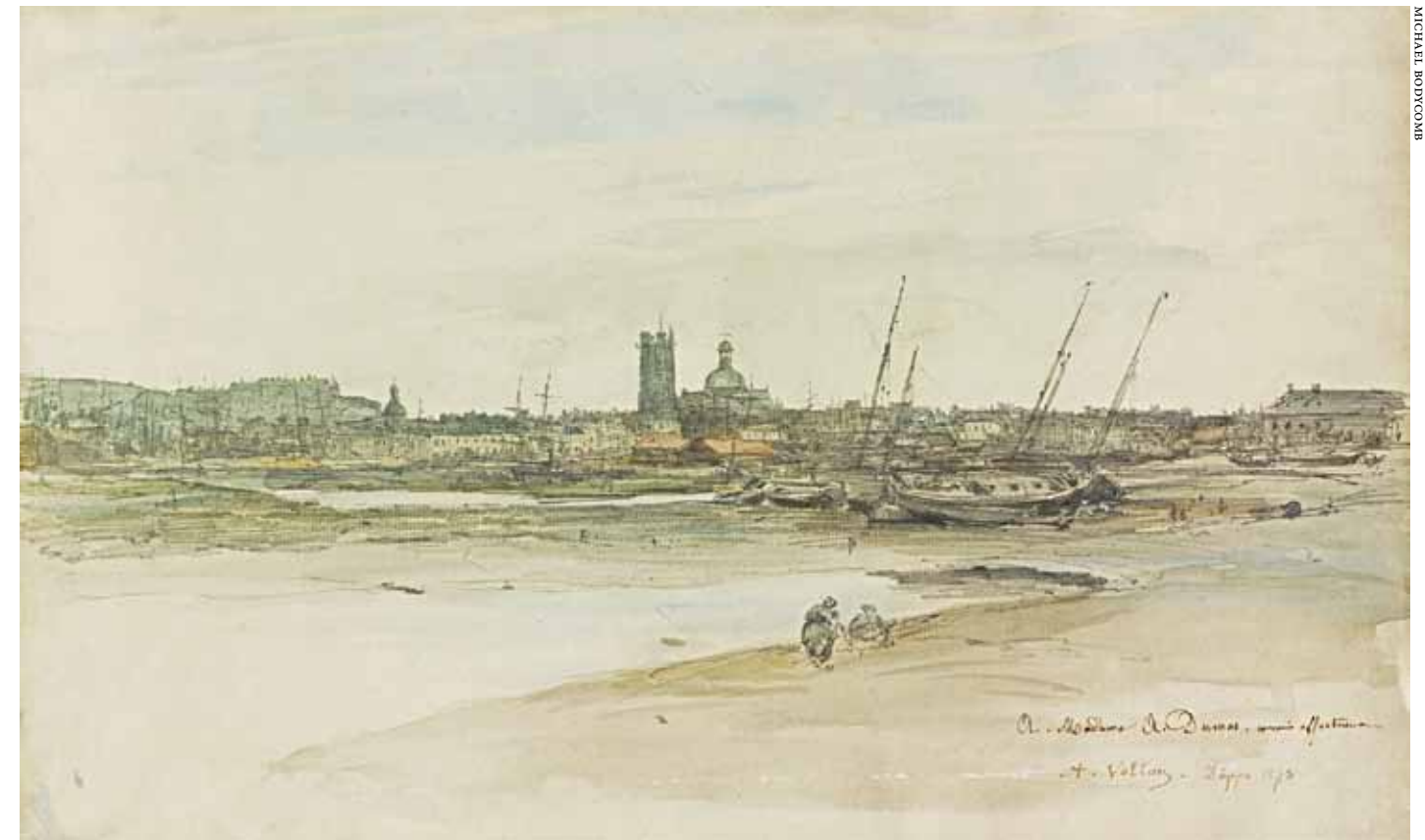
OPPOSITE PAGE Antoine Vollon (1833–1900), View of Dieppe Harbor , 1873, watercolor and graphite on laid paper, The Frick Collection, gift of Carol Forman Tabler in memory of Mr. and Mrs. Alexander A. Forman III

Although Vollon depicted the same view in a small oil painting (now lost), this large watercolor is an independent, finished drawing of the kind contemporary collectors eagerly sought. It contains a remarkable wealth of architectural and nautical details but remains, like many of the artist's canvases, deliberately sketchy in finish. The swift application of watercolor with a very wet brush across the laid paper leaves the depressions in the sheet clean. These and other untouched areas impart a subdued luminosity to the entire scene—as if bathed in the gray light of a sun filtered through thick cloud cover. The bold strokes of light blue in the sky suggest rapidly passing clouds and strong winds of salt air.