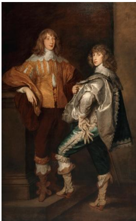
Thomas Gainsborough (1727–1788) Lords John and Bernard Stuart, after Anthony van Dyck , ca. 1765 Oil on canvas 92 1/2 × 57 1/2 in. (235 × 146.1 cm) Saint Louis Art Museum