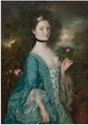
Thomas Gainsborough (1727–1788) Sarah Hodges, Later Lady Innes , ca. 1759 Oil on canvas 40 × 28 5/8 in. (101.6 × 72.7 cm) The Frick Collection, New York