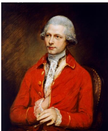
Thomas Gainsborough (1727–1788) John Joseph Merlin , ca. 1781 Oil on canvas 30 × 25 in. (76.2 × 63.5 cm) English Heritage, Kenwood House, London