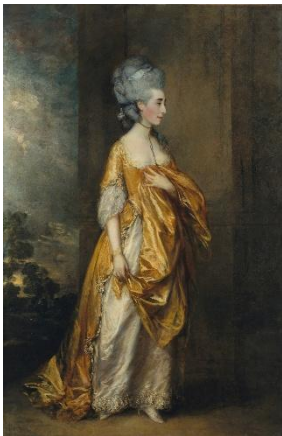
Thomas Gainsborough (1727–1788) Grace Dalrymple Elliott , 1778 Oil on canvas 92 1/4 × 60 1/2 in. (234.3 × 153.7 cm) The Metropolitan Museum of Art, New York