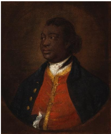
Thomas Gainsborough (1727–1788) Ignatius Sancho , 1768