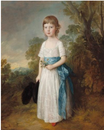
Thomas Gainsborough (1727–1788) Master John Heathcote , ca. 1771–72 Oil on canvas 50 × 39 13/16 in. (127 × 101.2 cm) National Gallery of Art, Washington, D.C.