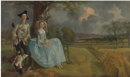
Thomas Gainsborough (1727–1788) Mr. and Mrs. Andrews , ca. 1750 Oil on canvas 27 1/2 × 47 in. (69.8 × 119.4 cm)