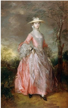
Thomas Gainsborough (1727–1788) Mary, Countess Howe , 1763–64 Oil on canvas 94 15/16 × 60 3/4 in. (243.2 × 154.3 cm) English Heritage, Kenwood House, London