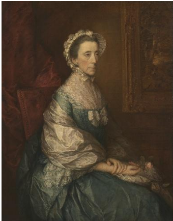
Thomas Gainsborough (1727–1788) Mary, Duchess of Montagu , ca. 1768