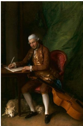
Thomas Gainsborough (1727–1788) Carl Friedrich Abel , ca. 1777 Oil on canvas 88 3/4 × 59 1/2 in. (225.4 × 151.1 cm) The Huntington Library, Art Museum, and Botanical Gardens, San Marino