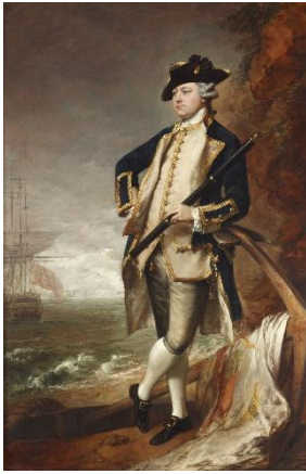
Thomas Gainsborough (1727–1788) Captain Augustus John Hervey, Later 3rd Earl of Bristol , ca. 1768