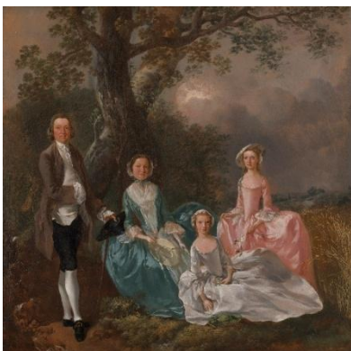
Thomas Gainsborough (1727–1788) The Gravenor Family , ca. 1754 Oil on canvas 35 1/2 × 35 1/2 in. (90.2 × 90.2 cm) Yale Center for British Art, New Haven