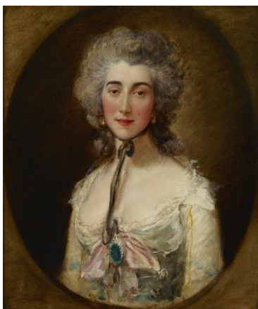
Thomas Gainsborough (1727–1788) Grace Dalrymple Elliott, 1782 Oil on canvas 30 1/8 × 25 in. (76.5 × 63.5 cm) The Frick Collection, New York