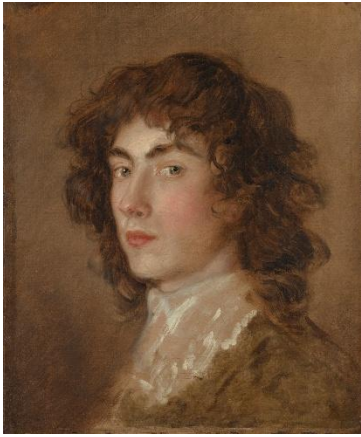
Thomas Gainsborough (1727–1788) Gainsborough Dupont , ca. 1770–72 Oil on canvas 17 15/16 × 14 3/4 in. (45.5 × 37.5 cm) Tate, London