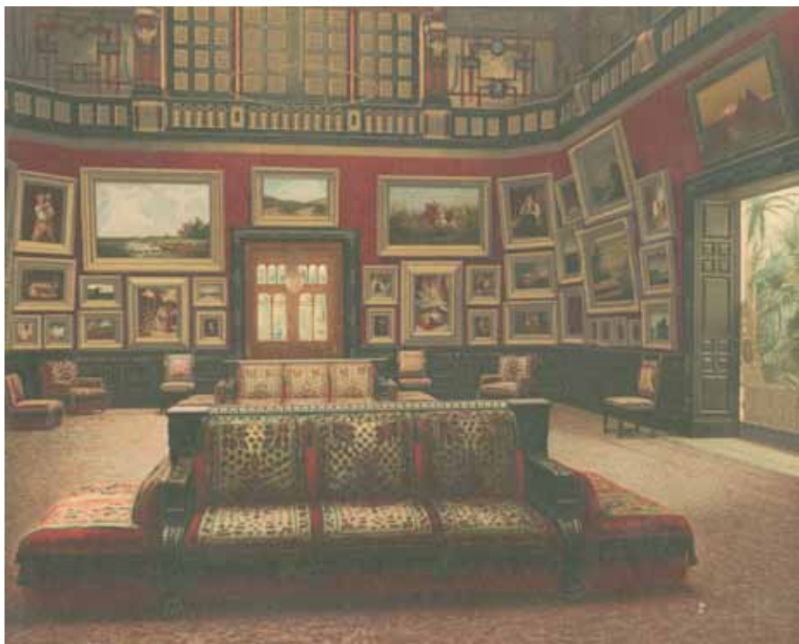
William H. Vanderbilt's Art Gallery at 640 Fifth Avenue, New York, c. 1880