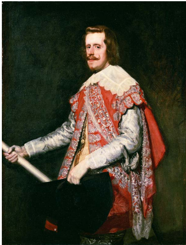
Philip IV by Velázquez