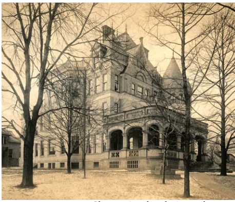
Clayton, Pittsburgh, Pennsylvania