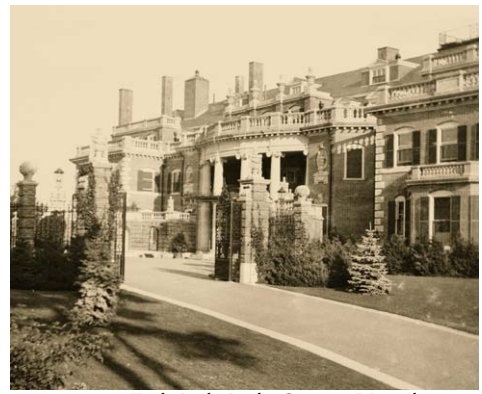
Eagle Rock, Prides Crossing, Massachusetts