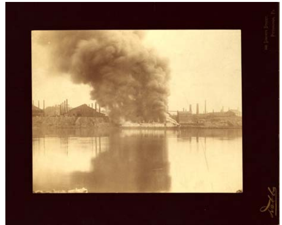
Burning barges on the Monongahela River