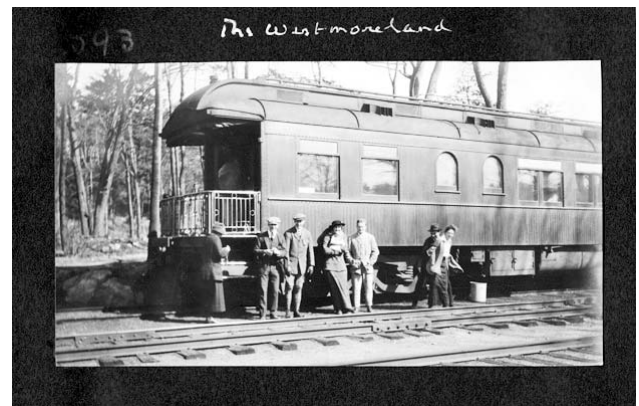
Miss Frick and friends outside the train car Westmoreland