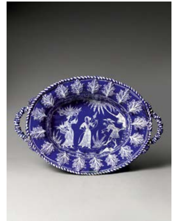
Basin, Nevers, ca. 1665-85, Faïence (tin-glazed earthenware), H. 19 1/2 inches, L. 22 3/4 inches, Promised Gift of Sidney R. Knafel, Photo: ©Camille Leprince

decoration—with figures wearing turbans, a shepardess, and peddlers—is inspired by early seventeenth-century French literature, including the popular novel L’Astrée , by Honoré d’Urfé (published 1607–27). These two exceptional pieces were originally intended for display during a banquet, set out on a credenza to impress guests, either inside a princely residence or outdoors, in a lavish jardin à la française (French garden).