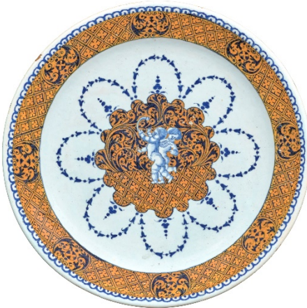
Plate, Rouen, ca. 1725, Faience (tin-glazed earthenware), D. 9 5/6 inches, Promised Gift of Sidney R. Knafel; photo: Michael Bodycomb

October 10, 2018, through September 22, 2019