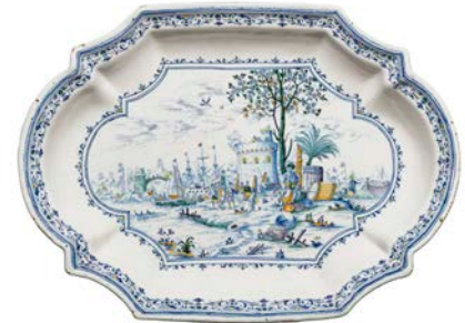
Clérissy manufactory, Platter , Moustiers, ca. 1730–40, Faience (tin-glazed earthenware), H: 12 1/4 inches W: 16 7/8 inches, Promised Gift of Sidney R. Knafel, Photo: Michael Bodycomb

Intended to help fund France's ongoing and costly wars, sumptuary laws passed by Louis XIV in 1679, 1689, and 1709 contributed to the rapid geographic expansion and stylistic development of faience. In December 1689, the Sun King sent his private collection of silver furniture to the royal mint to be melted down, an example reluctantly followed by the aristocracy, who were pressured to relinquish their own precious metal objects—mostly silver table services—for the benefit of the state. As described about 1715 by the celebrated French memoirist Saint-Simon, this resulted in a sudden craze among French aristocrats for domestic faience: “In eight days, all who were of grand or considerable standing used only faience services. They emptied the shops selling it, and ignited a heated frenzy for this merchandise.”