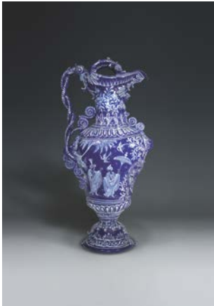
Ewer, Nevers, ca. 1680, Faïence (tin-glazed earthenware), H. 27 1/2 inches, W. 13 inches, Promised Gift of Sidney R. Knafel, Photo: Christophe Perlès

grotesques is largely inspired by Italian models. Its monochrome blue decoration, however, was produced mainly in Nevers but never in Italy.