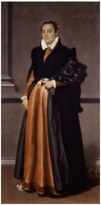
Giovanni Battista Moroni