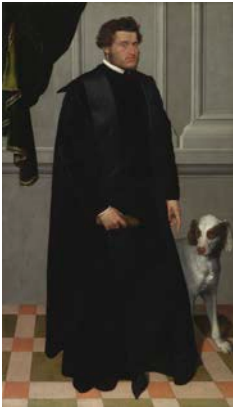
Giovanni Battista Moroni