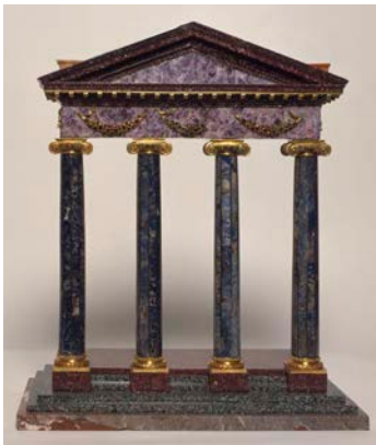
Luigi Valadier Reduction of the Temple of Mercury , ca. 1778 Lapis lazuli, amethyst, garnet, red porphyry, portasanta , green porphyry, and gilt bronze 17 7/8 x 17 3/8 inches Museo Arqueológico Nacional, Madrid