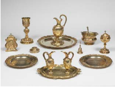
Luigi Valadier Cardinal Orsini Mass Service, ca. 1768 Gilt silver Capitolo Concattedrale, Muro Lucano