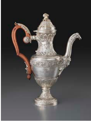
Luigi Valadier Coffee Pot with the Chigi Coat of Arms, 1777 Silver H. 15 inches Private Collection