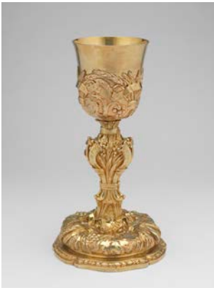
Luigi Valadier Chalice from the Orsini Mass Service , ca. 1768 Gilt silver H. 10 1/2 inches Capitolo Concattedrale, Muro Lucano