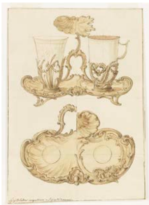
Luigi Valadier Design for a Trembleuse (Digioné), before 1762 Pen, brown ink, and brown and ocher wash on paper 13 1/8 × 9 3/8 inches Private Collection