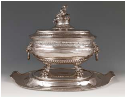
Luigi Valadier Soup Tureen and Tray, ca. 1780 Silver Tureen: 17 3/8 × 13 3/4 × 8 1/4 inches Tray: 19 1/4 × 11 3/4 inches Private Collection