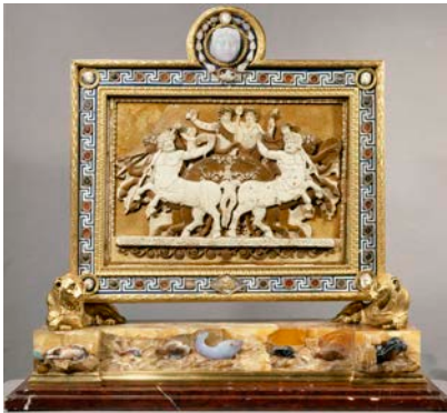
Luigi Valadier The Triumph of Bacchus , 1780 Agate, alabaster, ancient hardstones, ancient glass paste, gold, gilt metal, and gilt bronze 24 3/4 x 25 x 6 1/8 inches Musée du Louvre, Paris