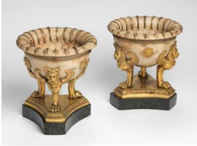
Luigi Valadier Two Tazzas , ca. 1780 White marble and gilt bronze H. 7 5/8 inches Private Collection