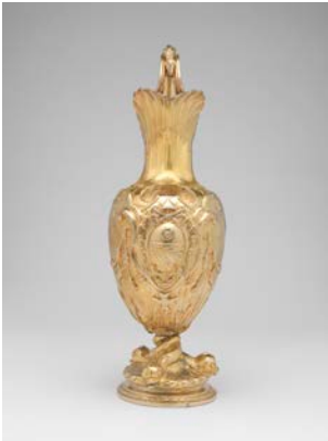
Luigi Valadier Ewer from the Orsini Mass Service , ca. 1768 Gilt silver H. 11 3/4 inches Capitolo Concattedrale, Muro Lucano