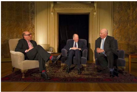
Sir David Cannadine, Lord Jacob Rothschild, and Peregrine Cavendish, Duke of Devonshire, in conversation during a 2014 program Chatsworth and Waddesdon: Collecting Then and Now