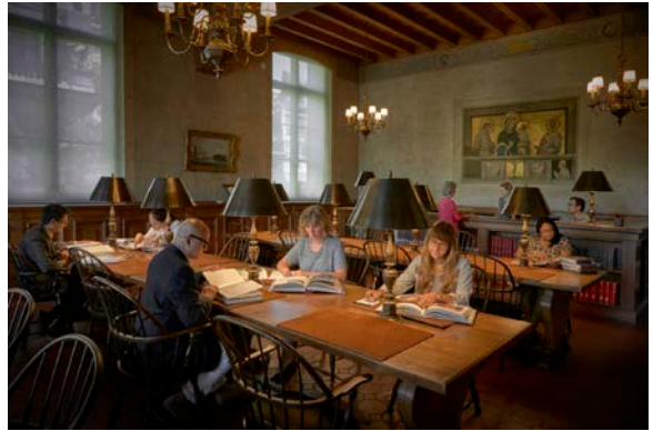
Main Reading Room of the Frick Art Reference Library, The Frick Collection, New York

The Center is ideally located in the Frick Art Reference Library, which has provided services and resources to scholars since its founding in 1920. Historically, the library has focused on amassing material that support object-oriented research and the chronicling of provenance information. Its Photoarchive and collection of more than 100,000 auction catalogues are invaluable to all research relating to collecting history, and thus the Center attracts scholars from around the world. Since its founding, the Center has awarded more than fifty short- and long-term fellowships—generously underwritten by the Leon Levy Foundation and the Samuel H. Kress Foundation—to individuals from numerous European countries, Canada, and Australia, as well as the United States. Often, the fellows’ research goes well beyond the traditional parameters of The Frick Collection and Frick Art Reference Library, as demonstrated by topics as varied as collecting East Indian art in the United States and the collecting practices of Max Ernst.