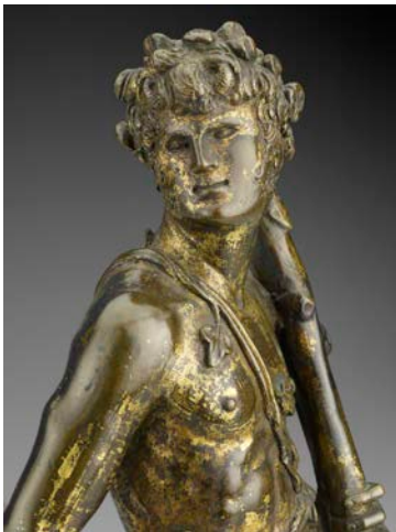
Bertoldo di Giovanni Shield Bearer (detail), ca. 1470–80 Gilt bronze H 8 7/8 inches The Frick Collection, New York