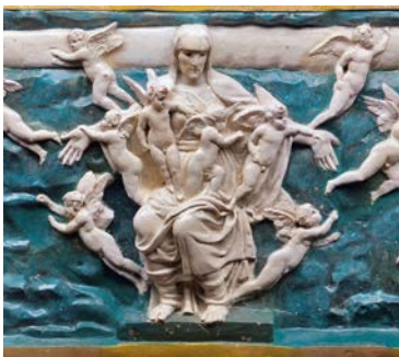
Bertoldo di Giovanni and collaborators Frieze for the Portico of the Medici Villa at Poggio a Caiano (detail), ca. 1490