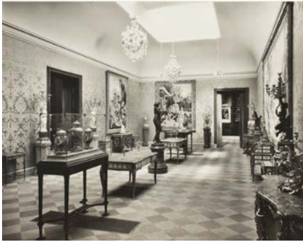
Arabella D. Huntington Memorial Art Collection, San Marino, California, ca. 1928 Getty Research Institute, Los Angeles