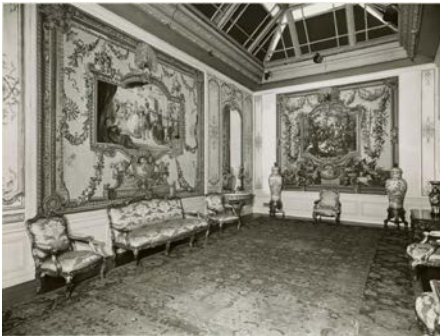
Don Quixote Room of Duveen Brothers Gallery at 720 Fifth Avenue, New York, n.d.