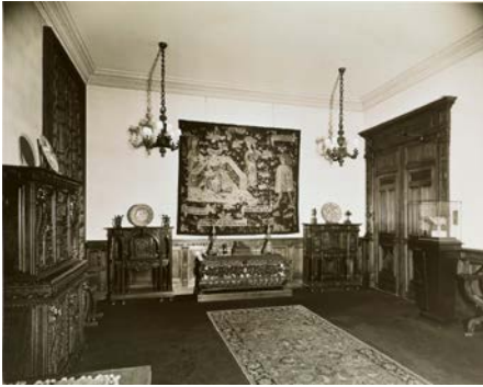
A showroom of Duveen Brothers Gallery at 720 Fifth Avenue, New York, n.d.