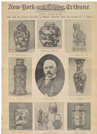
“Gems from the Garland Collection of Oriental Porcelains Saved for New York by J.P. Morgan,” New York Tribune, March 16, 1902