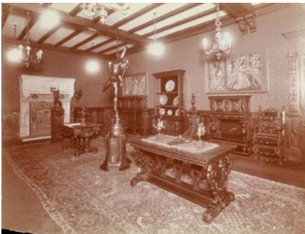
A showroom of Duveen Brothers Gallery at 720 Fifth Avenue, New York, n.d.