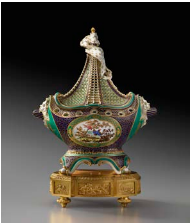
Pot-pourri “à Vaisseau,” France, Sèvres manufactory, ca. 1759

Soft-paste porcelain, with later addition of a gilt-bronze base