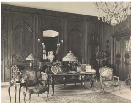
Living room of Miramar, Newport, Rhode Island, ca. 1914