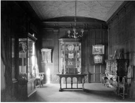
The Enamels Room at 1 East 70th Street, New York (now The Frick Collection), 1927