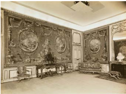
Tapestry Room of Duveen Brothers Gallery at 720 Fifth Avenue, New York, n.d.