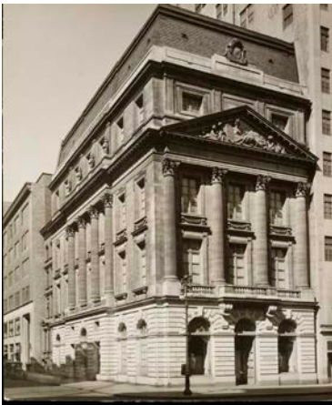
Duveen Brothers Gallery at 720 Fifth Avenue, New York, ca. 1912