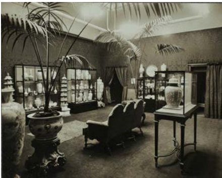
Exhibition of Rare Old Chinese Porcelains at Duveen Brothers Gallery, New York, January and February 1907