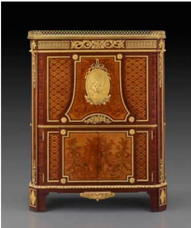
Upright Desk ( secrétaire en cabinet ), made for Marie-Antoinette, by Jean-Henri Riesener, France, Paris, ca. 1780 and 1790

Oak veneered with exotic woods; gilt-bronze mounts, leather, and marble