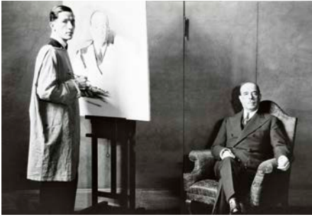
Joseph Duveen sitting for his painted portrait, 1933