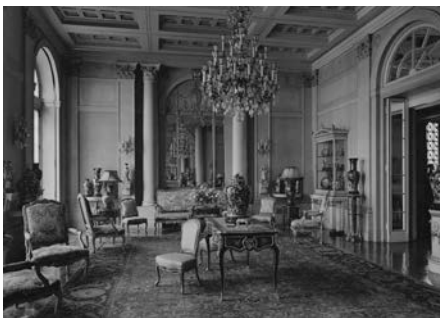
Drawing room of the home of John D. Rockefeller Jr. at 10 West 54th Street, New York, 1936