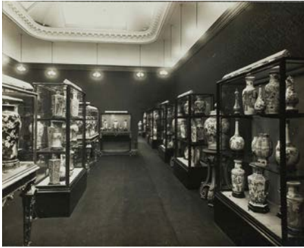
Exhibition of Rare Old Chinese Porcelains at Duveen Brothers Gallery, New York, January and February 1907