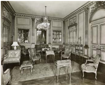
Gabriel Room of Duveen Brothers Gallery at 720 Fifth Avenue, New York, ca. 1946–47