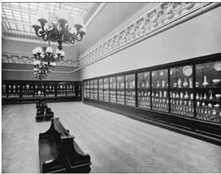
Chinese Porcelain Gallery (The Garland-Morgan Collection) at The Metropolitan Museum of Art, May 14, 1907