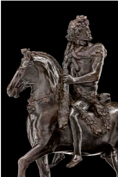
Hercules on Horseback, early 1470s, bronze, 27.2 cm high; Gallerie Estensi, Modena

Bertoldo is little known today, often seen merely as a student of Donatello, an instructor of Michelangelo, or a confidant of Lorenzo de' Medici (called il Magnifico) without deeper consideration of his own talents. The details of his life and artistic output, however, indicate a figure worthy of public attention. Rising from obscure origins as a child of a German immigrant family living in Florence, Bertoldo developed his technical skills under Donatello, eventually inheriting the master's models and completing the pulpits in the Basilica of San Lorenzo following Donatello's death. Bertoldo went on to gain the patronage of the most important political figure in Renaissance Florence, Lorenzo de' Medici. Their relationship developed over decades, with Bertoldo becoming a "famiare" of the city's de-facto ruler, eventually moving into the Medici palace, and creating numerous statuettes, reliefs, and medals for the Medici family. Bertoldo was responsible for much more than producing works of art, however; in addition to designing decorations for festivals, organizing architectural projects, and devising