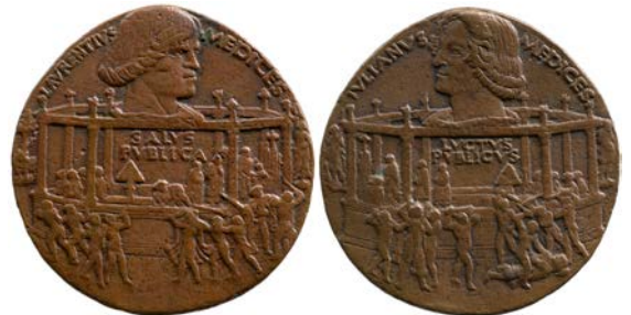
Lorenzo & Giuliano de' Medici: The Pazzi Conspiracy , 1478, bronze, 65.3 mm diameter, Scher Collection, promised gift to The Frick Collection, New York