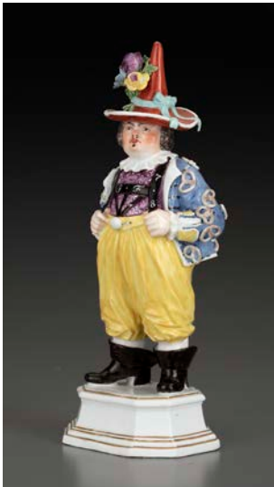
Figure of Hofnarr Fröhlich