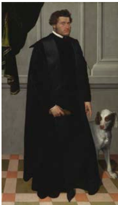
Giovanni Battista Moroni Gian Ludovico Madruzzo , ca. 1551-52