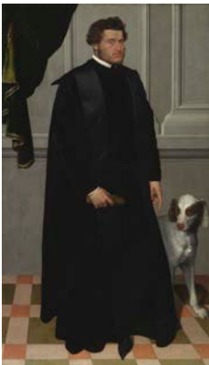
Giovanni Battista Moroni