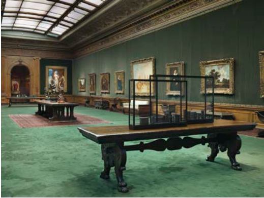
Edmund de Waal (b.1964), noontime and dawntime , 2019, porcelain, steel, and plexiglass, on view in the West Gallery, 33 7/16 × 65 3/4 × 18 7/8 inches, © Edmund de Waal.