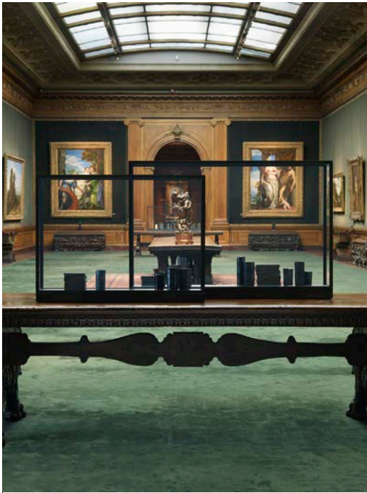
Edmund de Waal (b.1964), noontime and dawntime , 2019, porcelain, steel, and plexiglass, on view in the West Gallery, 33 7/16 × 65 3/4 × 18 7/8 inches, © Edmund de Waal. Courtesy the artist and The Frick Collection; photo: Christopher Burke