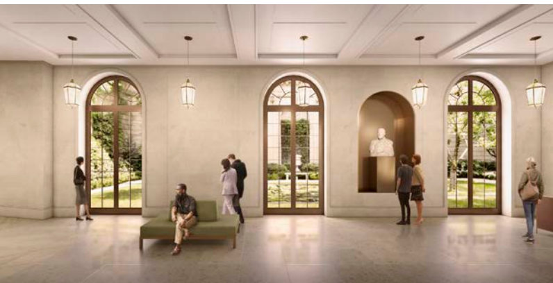
Rendering of The Frick Collection Reception Hall looking east towards 70th Street Garden; Courtesy of Selldorf Architects