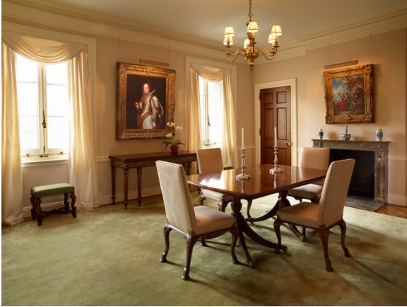
Present-day view of second –floor meeting room; The Frick Collection, New York; photo: Michael Bodycomb