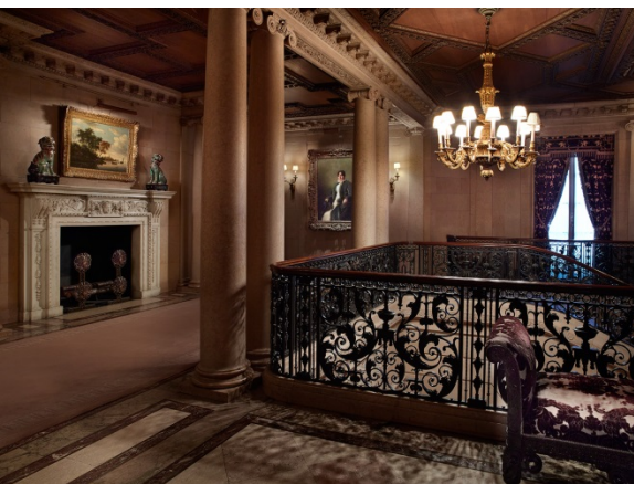
Top of the second floor landing, The Frick Collection, New York