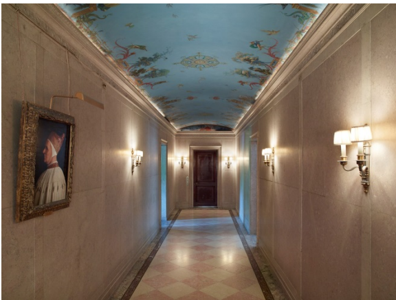
Second-floor corridor, The Frick Collection, New York