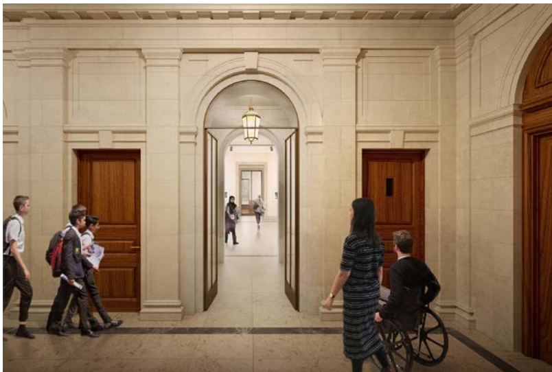
Rendering of entrance lobby of Frick Art Reference Library, showing new passageway connecting museum and library; Courtesy of Selldorf Architects