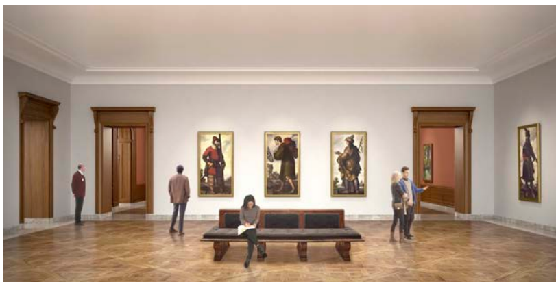
Rendering of the main-floor special-exhibition gallery; Courtesy of Selldorf Architects