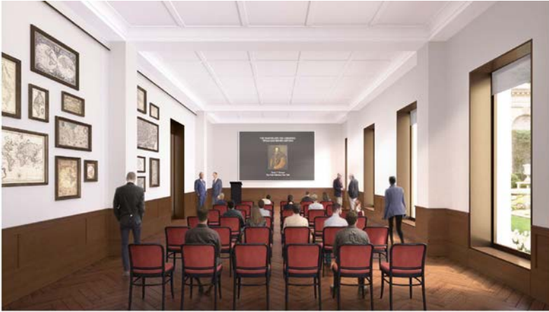
Rendering of a flexible program space in the Education Center of The Frick Collection, looking out on 70th Street Garden; Courtesy of Selldorf Architects