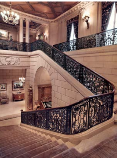
The Grand Staircase, The Frick Collection, New York