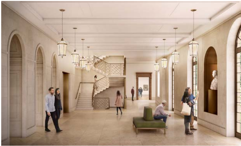
Rendering of The Frick Collection Entrance Hall looking north; Courtesy of Selldorf Architects