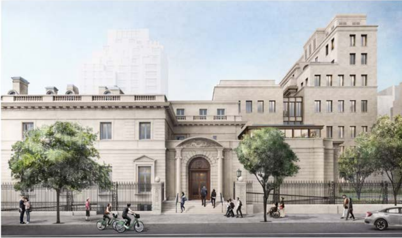
Rendering of The Frick Collection from 70th Street; Courtesy of Selldorf Architects