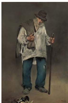
Édouard Manet, The Ragpicker , ca. 1865–71; possibly reworked in 1876, The Norton Simon Foundation

The Ragpicker , a monumental canvas more than six feet high, attests to Manet's devotion to audacious subject matter. He depicts the underbelly of modern Paris, the urban street-dwellers who subsisted on the refuse of others, through visual references to Golden Age Spanish painting and Velázquez, in particular. Part of a series provocatively titled The Four Philosophers , these paintings caused outrage among critics who upheld the tradition that such large-scale works should be reserved only for religious, historical, and royal subjects. The Ragpicker exemplifies the way that Manet combined diverse references from the past and present, from high and low culture, in order to formulate his incisive images of modern urban life.