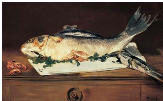
Édouard Manet, Still Life with Fish and Shrimp , 1864, Norton Simon Art Foundation

Still Life with Fish and Shrimp is one of Manet's best-preserved paintings, its surface still seeming to ripple from his energetic brush. Manet considered still life "the painter's touchstone," an opportunity for displaying mastery of oil paint and color at their most primal. Thinking of the controversial and radical subjects in some of Manet's work, Émile Zola wrote, "Even the most determined enemies of Édouard Manet's talent admit he paints inanimate objects well." Still Life with Fish and Shrimp allows us to look past the subject and relish the application of the paint itself.