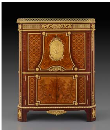
Jean-Henri Riesener (1734–1806) Secrétaire , ca. 1780 and 1791 Oak veneered with various woods including ash, bloodwood, and amaranth; gilt bronze, leather, marble 56 3/8 x 45 1/2 x 17 1/4 inches The Frick Collection, New York