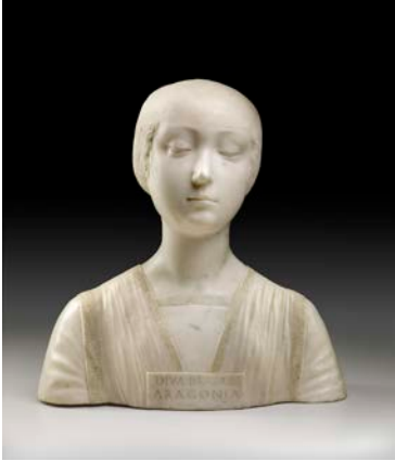
Francesco Laurana (ca. 1420/30–ca. 1502) Beatrice of Aragon, probably 1472–74 Marble 16 x 15 7/8 x 8 inches Bequest of John D. Rockefeller, Jr., 1961 The Frick Collection, New York