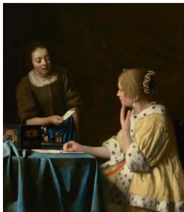
Johannes Vermeer (1632–1675) Mistress and Maid, ca. 1666–67 Oil on canvas 35 1/2 x 31 inches The Frick Collection, New York