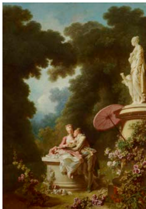
Jean-Honoré Fragonard (1732–1806) The Progress of Love: Love Letters , 1771–72 Oil on canvas 124 7/8 x 85 3/8 inches The Frick Collection, New York