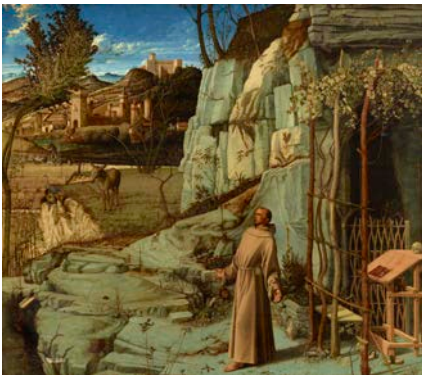
Giovanni Bellini (ca. 1424/35–1516) St. Francis in the Desert , ca. 1476–78 Oil on panel Panel: 49 1/16 x 55 7/8 inches Image: 48 7/8 x 55 1/16 inches The Frick Collection, New York