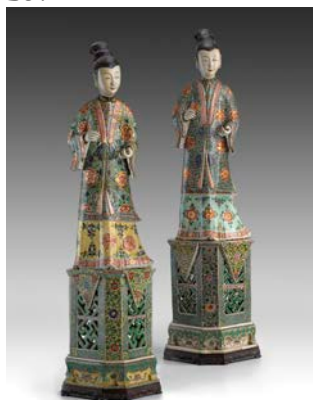
Chinese, Qing Dynasty (1644–1911) Two Figures of Ladies on Stands , 18 th century Hard-paste porcelain with polychrome overglaze 38 × 10 1/4 × 10 1/4 inches The Frick Collection, New York