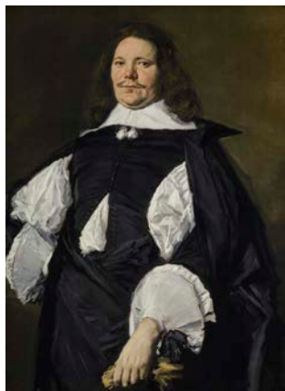
Frans Hals (ca. 1581–1666) Portrait of a Man , ca. 1660 Oil on canvas 44 1/2 x 32 1/4 inches The Frick Collection, New York