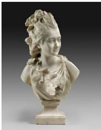
Jean-Antoine Houdon (1741–1828) The Comtesse du Cayla, 1777 Marble H.: 21 1/4 inches The Frick Collection, New York