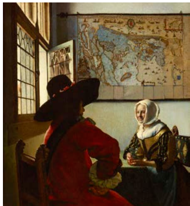
Johannes Vermeer (1632–1675) Officer and Laughing Girl, ca. 1657 Oil on canvas 19 7/8 x 18 1/8 inches The Frick Collection, New York