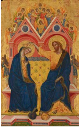
Paolo Veneziano (ca. 1259–1362) and Giovanni Veneziano (act. 1345–1358) The Coronation of the Virgin , 1358 Tempera on panel 43 1/4 x 27 inches The Frick Collection, New York