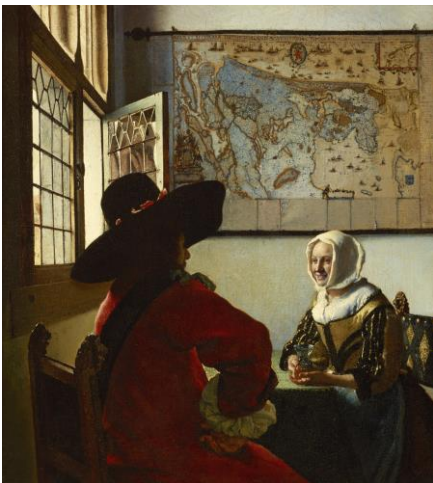
Johannes Vermeer (1632-1675) Officer and Laughing Girl ca. 1657 Oil on canvas 19 7/8 x 18 1/8 in. (50.5 x 46 cm) The Frick Collection, New York