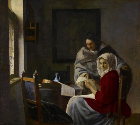
Johannes Vermeer (1632-1675) Girl Interrupted at Her Music ca. 1658-59 Oil on canvas 15 1/2 x 17 1/2 in. (39.4 x 44.5 cm) The Frick Collection, New York