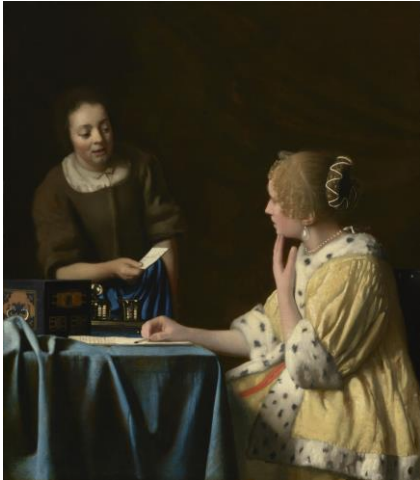
Johannes Vermeer (1632-1675) Portrait of a Man in Mistress and Maid Costume ca. 1666–67 Oil on canvas 35 1/2 x 31 in. (90.2 x 78.7 cm) The Frick Collection, New York