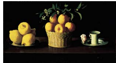
Francisco de Zurbarán, 1598–1664, Still Life with Lemons, Oranges and a Rose , 1633, oil on canvas, 62.2 x 109.5 cm, The Norton Simon Foundation

The Frick Collection is pleased to present a selection of five masterpieces of European painting from the highly acclaimed Norton Simon Museum in Pasadena, California. The exhibition, on view in the Oval Room from October 28, 2008, though January 18, 2009, will afford New York and East Coast audiences the occasion to see superb masterworks from the collections of the Norton Simon Art Foundation and The Norton Simon Foundation, a very special opportunity as both institutions generally do not allow their works to travel. The five featured paintings are Jacopo Bassano's (Jacopo da Ponte, 1510–1592) Flight into Egypt , c. 1544–45; Peter Paul Rubens' (1577–1640) Holy Women at the Sepulchre , c. 1611–14; Guercino's (Giovanni Francesco Barbieri, 1591–1666) Aldrovandi Dog , c. 1625; Francisco de Zurbarán's (1598–1664) Still Life with Lemons, Oranges and a Rose , 1633; and Bartolomé Esteban Murillo's (1617–1682) Birth of Saint John the Baptist , c. 1655. None of these artists is represented in the Frick's collection, and the outstanding quality of each of these Old Master paintings makes them well suited to be viewed in the company of the Frick's works.