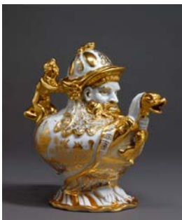
Teapot and Cover, Meissen porcelain; c. 1725–30; h: 15.2 cm, without cover, to tip of handle h: 13.7 cm; The Arnhold Collection

Although the formula for manufacturing true porcelain was developed in China by the sixth century, it remained a consuming mystery in the West until its discovery in 1709 by alchemist Johann Friedrich Böttger (1682–1719) under the patronage of August II, elector of Saxony and king of Poland. The following year, the king established a royal manufactory outside of Dresden in the town of Meissen, and the porcelain created there has