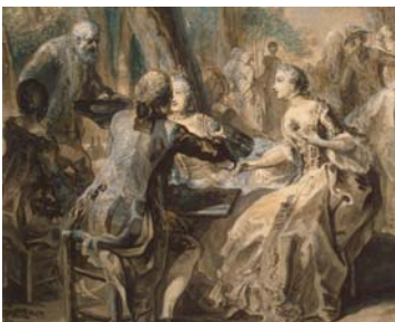
Gabriel de Saint-Aubin, 1724-1780, Society Promenade (detail), 1760, pen and brown and black ink, brush and gray wash, watercolor, and gouache, 31.4 x 25.8 cm, The Hermitage, Saint Petersburg

October 30, 2007, through January 27, 2008