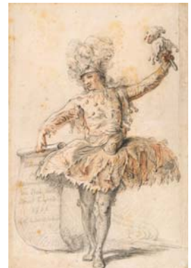
Momus , 1752, red, black, and white chalk, 35.3 x 24.2 cm, The Morgan Library & Museum, New York

achievement in a variety of thematic areas, ranging from ancient history to portraiture to the decorative arts, while highlighting the representations of contemporary Paris for which he is best known. Indeed, the exhibition provides visitors with the opportunity to glimpse Paris as it was two hundred and fifty years ago, through appealing depictions of the city's architecture, theater, the Salon, domestic life, and popular entertainment, all subjects that Saint-Aubin rendered in an immediate, impressionistic style that anticipates that of artists of the late nineteenth century. Several fine examples of a unique aspect of his work—the small art sale and exhibition catalogues that he filled with hand-drawn illustrations in the margins of the printed texts—are also featured. The exhibition and its accompanying catalogue—the first monographic color publication on the artist—will be the foundation for future decades of Saint-Aubin appreciation and research (publication information can be found below with Shop highlights).