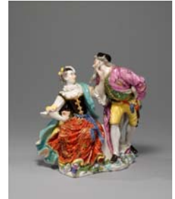
Pantalone and Columbine, Meissen porcelain, c. 1740. Model by Johann Joachim Kändler, 1736–38, h 17 cm, The Arnold Collection