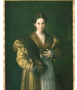
Parmigianino (1503–1540), Antea , c.1531–1534, oil on canvas, 136 x 86 cm, Museo di Capodimonte, Naples