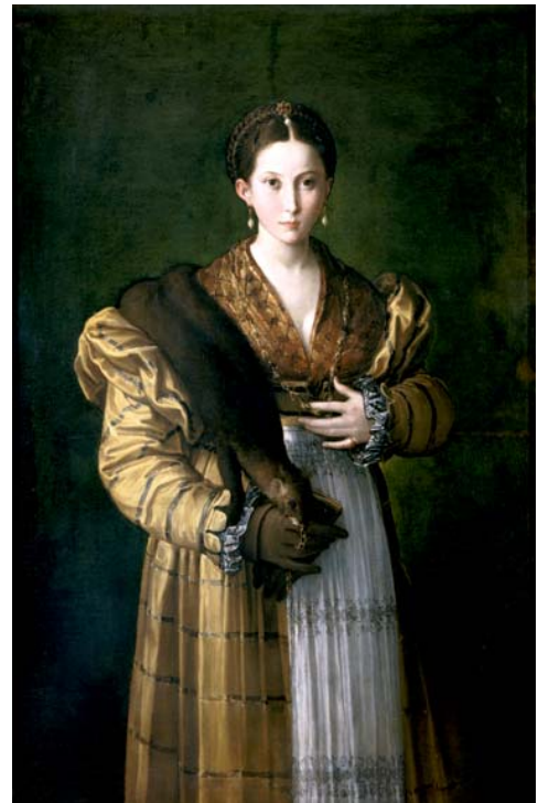
Parmigianino (1503–1540), Antea , c.1531-1534, oil on canvas, 136 x 86 cm, Museo di Capodimonte, Naples