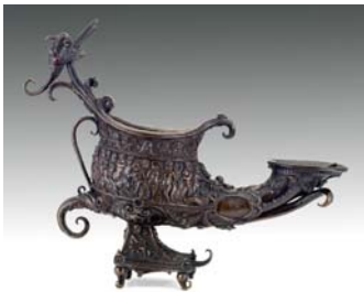
Andrea Briosco Riccio (1470-1532), Lamp, 15 th century, 16.83 cm, The Frick Collection, New York

September 16, 2008, through January 4, 2009