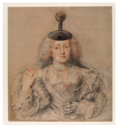
Peter Paul Rubens (1577–1640), Helena Fourment, c. 1630, black, red, and white chalk and pen and ink, 24 x 21 ½ inches, The Courtauld Gallery (Samuel Courtauld Trust)

October 2, 2012, through January 27, 2013