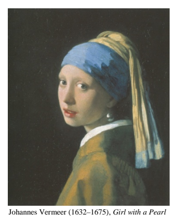
Earring, c. 1665, oil on canvas, 44.5 x 39 cm, Mauritshuis, The Hague

October 22, 2013, through January 21, 2014