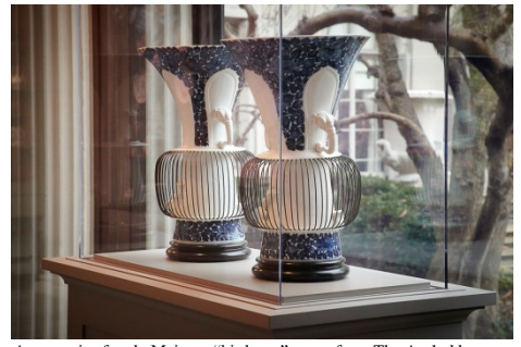
A rare pair of early Meissen "birdcage" vases from The Arnhold Collection on view in The Frick Collection's new Portico Gallery

This year, visitors to The Frick Collection have been enjoying a new gallery—the first major addition to the museum's display spaces in nearly thirty-five years. Since opening last December, the Portico Gallery has won a Merit Award from the American Institute of Architects (AIA) New York Chapter, as well as the Transformation Award from the Friends of the Upper East Side Historic Districts. Designed by architects and planners Davis Brody Bond, the gallery integrates the outdoor garden portico on Fifth Avenue into the fabric of the museum, offering fresh vistas as well as a light and airy space devoted to the display of decorative arts and sculpture.