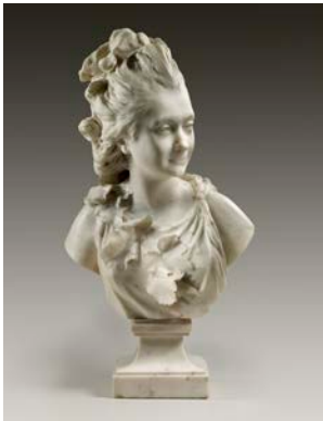
Jean-Antoine Houdon, The Comtesse du Cayla, 1777. Marble. The Frick Collection, New York.

Jean-Antoine Houdon (1741–1828) and Claude Michel, called Clodion (1738–1814), were two of the foremost sculptors in France during the late eighteenth century. The Frick Collection houses an important group of works by the artists, which was established in 1915, when founder Henry Clay Frick acquired Clodion's terracotta Zephyrus and Flora and, the following year, Houdon's marble bust of the Comtesse du Cayla. These masterpieces—along with nearly all the examples by the two sculptors that were subsequently added to the collection—are being shown together for the first time, highlighting the artists' expressive ranges, as well as their defining contributions to the sculpture of Enlightenment-era France.