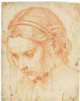
Andrea del Sarto (1486–1530), Study of the Head of a Young Woman , ca. 1523. Red chalk. Galleria degli Uffizi, Gabinetto dei Disegni e delle Stampe

October 7, 2015, through January 10, 2016