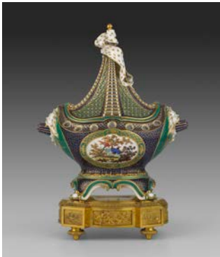
Sèvres Porcelain Manufactory, Potpourri Vase "à Vaisseau," ca. 1759. Soft-paste porcelain. The Frick Collection, New York

Between 1916 and 1918, Henry Clay Frick purchased several important pieces of porcelain to decorate his New York mansion. Made at Sèvres, the preeminent eighteenth-century French porcelain manufactory, the objects—including vases, potpourris, jugs and basins, plates, a tea service, and a table—were displayed throughout Frick’s residence. From Sèvres to Fifth Avenue brings them together for the first time, along with a selection of pieces acquired at a later date, some of which are rarely on view. The exhibition presents a new perspective on the collection by exploring the role Sèvres porcelain played in eighteenth-century France, as well as during the American Gilded Age.