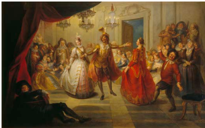
Charles Coypel (French, 1694–1752), Don Quixote at Don Antonio Moreno's Ball , 1731. Oil on canvas. Palais Impérial de Compiègne; long-term loan from the Musée du Louvre, Paris (3566).

A masterpiece of comic fiction, Cervantes's Don Quixote (fully titled The Ingenious Gentleman Don Quixote of La Mancha ) enjoyed great popularity from the moment it was published, in two volumes, in 1605 and 1615, respectively. Reprints and translations spread across Europe, captivating the continental imagination with the escapades of the knight Don Quixote and his companion, Sancho Panza. The novel's most celebrated episodes inspired a multitude of paintings, prints, and interiors. Most notably, Charles Coypel (1694–1752), painter to Louis XV, created a series of twenty-eight cartoons to be produced by the Gobelins tapestry manufactory in Paris. Twenty-seven were painted between 1714 and 1734, with the last scene realized just