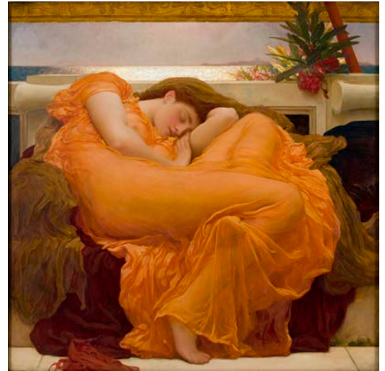
Frederic Leighton (1830–1896), Flaming June , c. 1895, oil on canvas, Museo de Arte de Ponce, The Luis A. Ferré Foundation, Inc.

ANDREA DEL SARTO: THE RENAISSANCE WORKSHOP IN ACTION October 7, 2015, through January 10, 2016