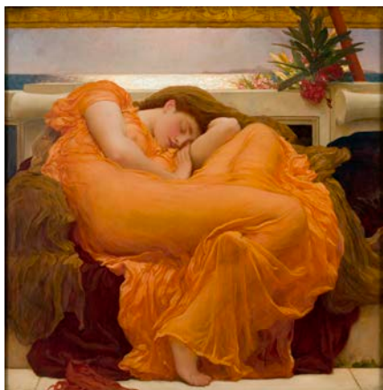
Frederic Leighton (1830–1896), Flaming June , c. 1895, oil on canvas, Museo de Arte de Ponce, The Luis A. Ferré Foundation, Inc.

June 10, 2015, through September 6, 2015