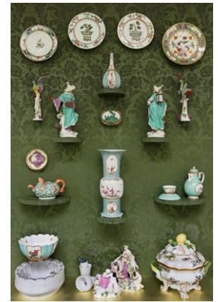
Installation view; photo: Michael Bodycomb

Shechet's "artist's eye" perspective eschews the typical chronological or thematic order of most installations in favor of a personal approach that opens an intriguing visual and technical dialogue between the contemporary and the historical. Her installation is inspired by the domestic setting of the Frick's galleries, which are characterized by a combination of objects, textures, colors, and materials. Shechet turned to objects from the Frick's permanent collection when designing the display cases, taking as her inspiration, for example, the eighteenth-century French table by André-Charles Boulle that is currently in the Living Hall. Likewise, the green damask behind the exhibition's display cases evokes the museum's fabric-covered walls.