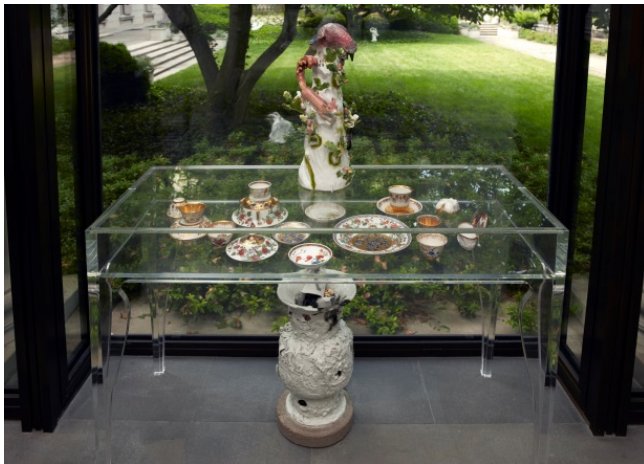
Installation view of Bird, Squirrel, and Stag Beetle on a Tree Trunk , Meissen porcelain, model by Johann Joachim Kändler, 1739, Private collection, on view in Porcelain, No Simple Matter: Arlene Shechet and the Arnold Collection in the Frick's Portico Gallery; photo: Michael Bodycomb

The exhibition's location in the Portico Gallery, overlooking the museum's historic Fifth Avenue Garden, reflects Shechet's wish to extend the exhibition into the garden while simultaneously bringing the natural world indoors. For this reason, plexiglass was chosen for the two pedestal tables near the floor-to-ceiling windows in order to offer an unobstructed view of the garden. The theme of the exhibition also derives from its location, with the featured pieces selected for their evocations and depictions of nature, an important source of inspiration for artists working at the Meissen factory, including Shechet.