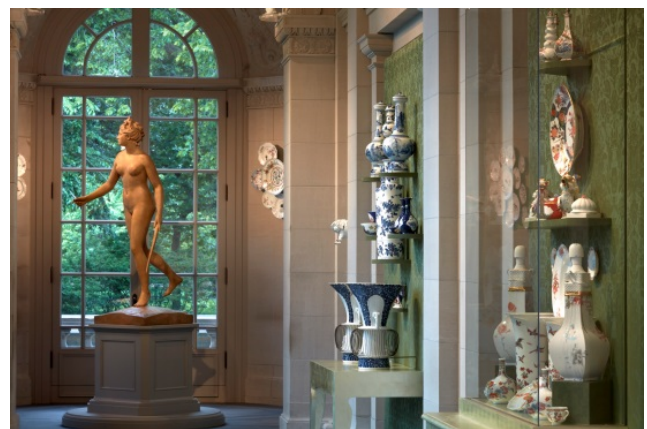
Installation view; photo: Michael Bodycomb

The integration of Shechet's work with porcelain from Mr. Arnhold's collection creates a kind of tableau vivant in which the objects—figures, cups, teapots, and vases—seem to come to life, a direct reference to the eighteenth-century European concept of animating inanimate objects. The display also references late seventeenth- and eighteenth-century European gardens that invited contemplation of art and nature, as well as contemporaneous "porcelain rooms" in which walls were covered with hundreds of pieces of porcelain, often arranged by color. As in these historical settings, surprise and delight are at the core of the installation; look for porcelain birds mounted overhead in the Portico's rotunda and large Meissen animals outside, their stark white a dramatic contrast to the greenery of the garden.