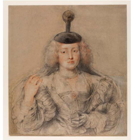
Peter Paul Rubens (1577–1640), Helena Fourment , c. 1630, black, red, and white chalk and pen and ink, 24 x 21 ½ inches; The Courtauld Gallery (Samuel Courtauld Trust)

In keeping with its tradition of exhibiting masterworks from collections outside of New York, the Frick will present fifty-eight drawings this fall from The Courtauld Gallery, London. This exhibition marks the first time that so many of the principal drawings from The Courtauld's renowned collection—one of Britain's most important—have been made available for loan. The prized sheets represent a survey of the extraordinary draftsmanship of Italian, Dutch, Flemish, German, Spanish, British, and French artists active during the late Middle Ages through the early twentieth century. The exhibition features works executed in a range of drawing techniques and styles and for a variety of purposes, including preliminary sketches, practice studies, aide-mémoires , designs for other artworks, and