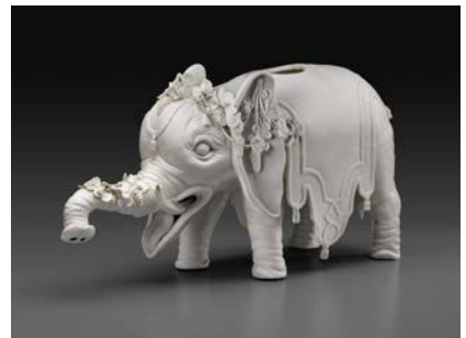
Du Paquier Porcelain Manufactory, Elephant Wine Dispenser, ca. 1740, Du Paquier porcelain, The Frick Collection, gift from the Melinda and Paul Sullivan Collection, 2016; photo: Michael Bodycomb

Fired by Passion will present about forty tureens, drinking vessels, platters, and other objects produced by Du Paquier between 1720 to 1740, which were coveted by aristocrats in Vienna and throughout Europe. In addition to exploring the rivalry between the Du Paquier and Meissen manufactories, the exhibition will highlight the eclectic mix of references—many of them East Asian—that inspired Du Paquier porcelain. Splendid examples with coats of arms and heraldic symbols from commissions across Europe will also illustrate the manufactory's success and influence beyond Vienna. Fired By