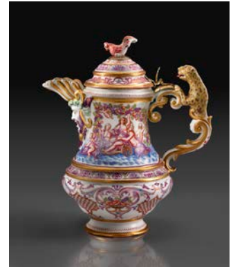
Ewer, 1725–30, hard-paste porcelain, The Frick Collection, gift from the Melinda and Paul Sullivan Collection, 2016

While the Du Paquier manufactory often took inspiration from Meissen and Asian porcelain, it also developed its own innovative decorative styles, forms, and techniques. A hallmark of the manufactory is its playful handles, knobs, and finials in the shape of animals or figurines. An exuberant ewer in the exhibition (right) features a handle in the shape of a panther (generally associated with Bacchus, the Roman god of wine) and an elaborately painted scene featuring the sea goddess Amphitrite, suggesting that the vessel was meant to serve both wine and water. This piece also illustrates perhaps the most characteristic feature of Du Paquier porcelain, its vivid painted decoration, in a palette dominated by rich purple and pink, iron-red, violet, blue, yellow, and several shades of green.