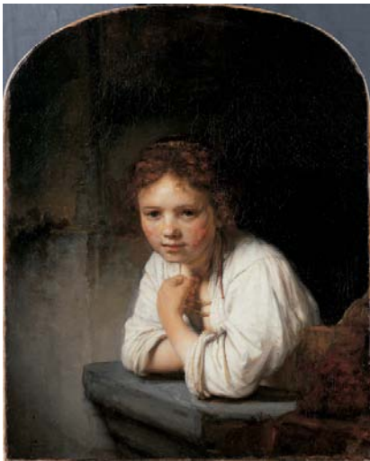
Rembrandt van Rijn (1606–1669), A Girl at a Window, 1645, oil on canvas, 81.6 x 66 cm, Bourgeois Bequest, 1811

This spring, the Frick presents a special exhibition of loans from Dulwich Picture Gallery, one of the major collections of Old Master paintings in the world. Heralding the London museum's bicentenary in 2011, the exhibition will introduce American audiences to this institution's holdings and history through nine of its most important and best-loved works. Indeed, Masterpieces of European Painting from Dulwich Picture Gallery , to be shown exclusively at the Frick from March 9 through May 30, 2010, includes signature works that seldom travel, many of which have not been on view in the United States in recent years, and, in some cases, never in New York City. Featured are Anthony Van Dyck's Samson and Delilah , c. 1619–20; Nicolas Poussin's Nurture of Jupiter , c. 1636–37; Rembrandt van Rijn's Girl at a Window , 1645; Peter Lely's Nymphs by a Fountain , c. 1650; Gerrit Dou's Woman Playing a Clavichord ,