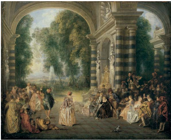
Jean-Antoine Watteau (1684–1721), Les Plaisirs du bal (Pleasures of the Dance) , c. 1717, oil on canvas, 52.6 x 65.4 cm, Bourgeois Bequest, 1811, © The Trustees of Dulwich Picture Gallery