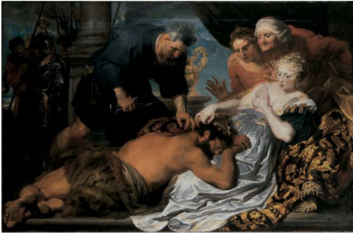
Sir Anthony Van Dyck (1599–1641), Samson and Delilah, c. 1618–20, oil on canvas, 151.4 x 230.5 cm, Bourgeois Bequest, 1811

Anthony Van Dyck is known for his stylish and flamboyant portraits of the Flemish, Genoese, and English aristocracy. Henry Clay Frick owned eight important examples of Van Dyck's work, including James, Seventh Earl of Derby, His Lady and Child (1632–41) and Anne, Countess of Clanbrassil (1636). Van Dyck painted religious and mythological subjects as well, and one of his most significant early canvases, Samson and Delilah —painted when the artist was in his twenties—is included in the upcoming exhibition. The work is a