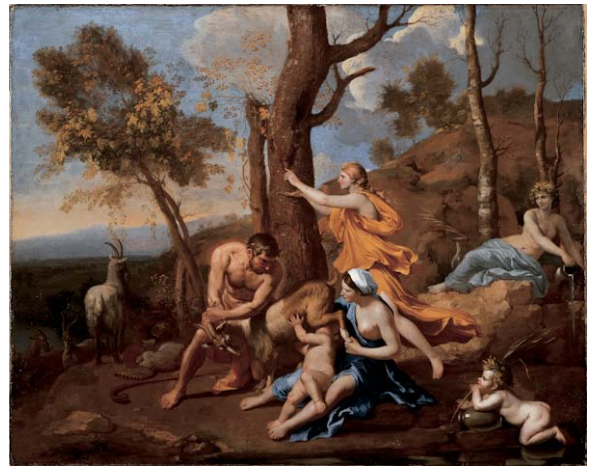
Nicolas Poussin (1594–1665), The Nurture of Jupiter, c. 1636–37, oil on canvas, 96.2 x 119.6 cm, Bourgeois Bequest, 1811