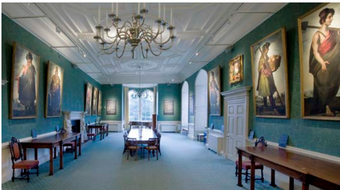
Zurbarán and other works on display in the Long Dining Room at Auckland Castle

series of single-figure works representing the saints, the Apostles, and various other subjects for ecclesiastical institutions and palaces throughout Spain and the Spanish colonies. With a decline in Seville's economy in the 1640s and the plague of 1649, he turned increasingly to the Latin American market, supplying paintings on commission to churches, monasteries, and wealthy individuals, while also selling workshop pieces on the open market in Buenos Aires and Lima, Peru. Between 1640 and 1645, Zurbarán and his assistants produced the remarkable series Jacob and His Twelve Sons , which is on view at The Frick Collection through the spring of 2018. Co-organized by the Frick with the