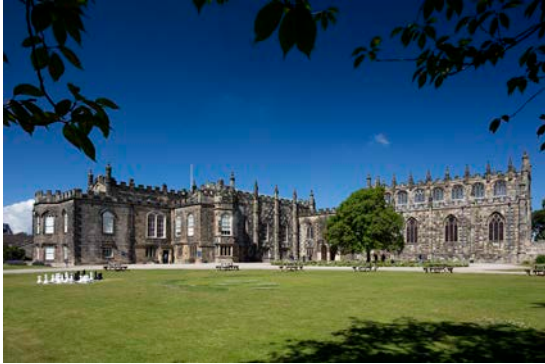
Auckland Castle