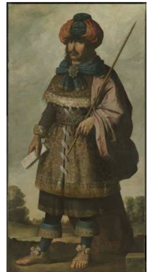
Francisco de Zurbarán (1598–1664). Joseph, ca. 1640–45, oil on canvas, Auckland Castle, County Durham

Francisco de Zurbarán helped to define Seville's Golden Age, a period of economic expansion and cultural resurgence in the late sixteenth and early seventeenth centuries, when the Andalusian seaport monopolized trade with the New World. Throughout the late 1620s and 1630s, the artist and his workshop produced monumental multi-figure paintings as well as