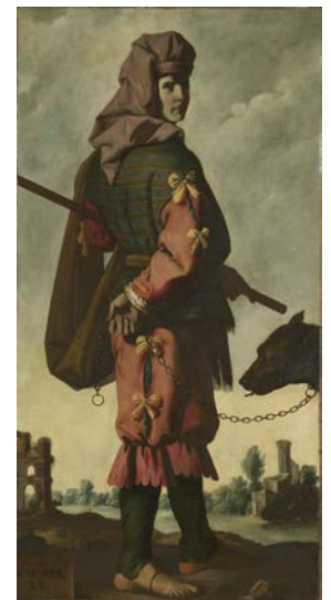
Zurbarán, Benjamin , ca. 1640–45, oil on canvas, Grimsthorpe Castle, Lincolnshire

as well as the rod and document he holds, denote his status as a viceroy in the court of the Egyptian pharaoh (see illustration on front page). In contrast to Joseph’s stately posture and rich attire, Benjamin, the youngest son, is depicted in country dress in an active twisting pose, seen from the back. The wolf, which he holds by a chain, derives from his blessing: “Benjamin is a ravenous wolf, in the morning devouring the prey, and at evening dividing the spoil,” a reference to his tribe’s reputation for fierceness in battle. Some brothers received less favorable prophesies. Describing his eldest son, Reuben, as “unstable as water,” Jacob stated, “you shall no longer excel because you went up onto your father’s bed; then you defiled it,” a reference to Reuben sleeping with Jacob’s concubine, Bilhah, as told in an earlier chapter in Genesis. In keeping with his status as firstborn, Reuben wears an elaborate costume and leans against a column, signifying his strength and fortitude. His downcast, shaded eyes and inward expression, however, reflect Jacob’s