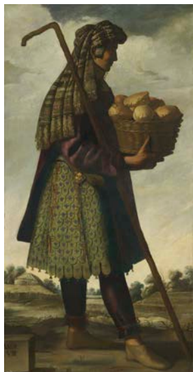
Zurbarán, Asher, ca. 1640–45, oil on canvas, Auckland Castle, County Durham

On his deathbed, Jacob assembled his sons to foretell what was to become of them and their tribes. Judah was an ancestor of kings David and Solomon, and, in the Christian tradition, of Jesus. To him Jacob said, “Judah, your brothers shall praise you; your hand shall be on the neck of your enemies; your father’s sons shall bow down before you. Judah is a lion’s whelp . . . The scepter shall not depart from Judah, nor the ruler’s staff from between his feet.” Underlining his status, Zurbarán presented Judah frontally, as the most regal and imposing of all the sons in the series. He is clothed opulently with a crown, scepter, fur stole, and crouching lion. Joseph, Jacob’s favorite son, was sold into slavery by his jealous brothers and taken to Egypt, where he rose to a high station. His luxurious robes and turban,