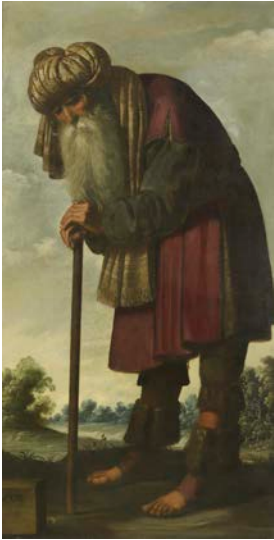
Zurbarán, Jacob , ca. 1640–45, oil on canvas, 79 1/8 x 40 5/16 inches (201 x 102.4 cm)

primary biblical source for the paintings was the “The Blessings of Jacob,” a prophetic poem in Chapter 49 of Genesis. In developing the iconography of the series, Zurbarán also drew from visual sources. A posthumous inventory of his studio revealed some seventy sixteenth- and seventeenth-century northern European prints that he mined for poses and gestures for this series and other works, as well as costume elements and attributes. For the Auckland paintings, Zurbarán turned largely to engravings depicting Jacob and his twelve sons that were executed in 1589 by Jacques de Gheyn II, after designs by Karel van Mander I. The expressive and highly distinctive faces of each son, however, suggest that they were painted from life. On canvases measuring nearly seven feet in height, full-length figures wearing sumptuous, exotic costumes tower over varied landscapes. Each son is rendered with a strong sense of individuality, while forming part of a cohesive, choreographed group, as if participants in a procession. The works are unsigned, indicating that they were carried out with the participation of assistants. However, the recent conservation study has revealed evidence of techniques specific to Zurbarán, confirming his high level of involvement.