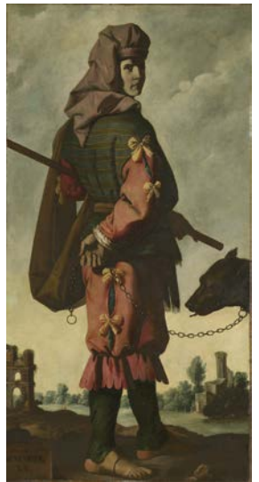
Zurbarán, Benjamin , ca. 1640–45, oil on canvas, Grimsthorpe Castle, Lincolnshire

as well as the rod and document he holds, denote his status as a viceroy in the court of the Egyptian pharaoh (see illustration on front page). In contrast to Joseph’s stately posture and rich attire, Benjamin, the youngest son, is depicted in country dress in an active twisting pose, seen from the back. The wolf, which he holds by a chain, derives from his blessing: “Benjamin is a ravenous wolf, in the morning devouring the prey, and at evening dividing the spoil,” a reference to his tribe’s reputation for fierceness in battle. Some brothers received less favorable prophesies. Describing his eldest son, Reuben, as “unstable as water,” Jacob stated, “you shall no longer excel because you went up onto your father’s bed; then you defiled it,” a reference to Reuben sleeping with Jacob’s concubine, Bilhah, as told in an earlier chapter in Genesis. In keeping with his status as firstborn, Reuben wears an elaborate costume and leans against a column, signifying his strength and fortitude. His downcast, shaded eyes and inward expression, however, reflect Jacob’s