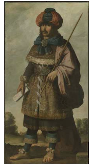
Francisco de Zurbarán (1598–1664). Joseph, ca. 1640–45, oil on canvas, Auckland Castle, County Durham

Francisco de Zurbarán helped to define Seville's Golden Age, a period of economic expansion and cultural resurgence in the late sixteenth and early seventeenth centuries, when the Andalusian seaport monopolized trade with the New World. Throughout the late 1620s and 1630s, the artist and his workshop produced monumental multi-figure paintings as well as