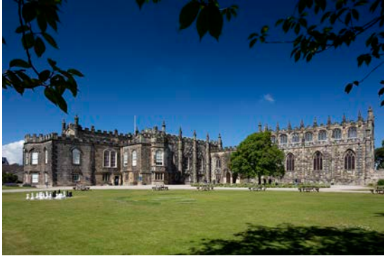
Auckland Castle