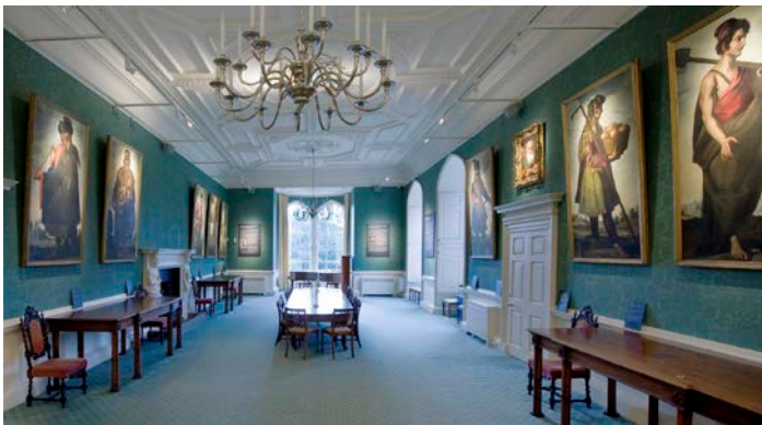
Zurbarán and other works on display in the Long Dining Room at Auckland Castle

series of single-figure works representing the saints, the Apostles, and various other subjects for ecclesiastical institutions and palaces throughout Spain and the Spanish colonies. With a decline in Seville's economy in the 1640s and the plague of 1649, he turned increasingly to the Latin American market, supplying paintings on commission to churches, monasteries, and wealthy individuals, while also selling workshop pieces on the open market in Buenos Aires and Lima, Peru. Between 1640 and 1645, Zurbarán and his assistants produced the remarkable series Jacob and His Twelve Sons , which is on view at The Frick Collection through the spring of 2018. Co-organized by the Frick with the