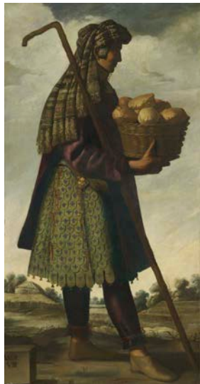
Zurbarán, Asher, ca. 1640–45, oil on canvas, Auckland Castle, County Durham

On his deathbed, Jacob assembled his sons to foretell what was to become of them and their tribes. Judah was an ancestor of kings David and Solomon, and, in the Christian tradition, of Jesus. To him Jacob said, “Judah, your brothers shall praise you; your hand shall be on the neck of your enemies; your father’s sons shall bow down before you. Judah is a lion’s whelp ... The scepter shall not depart from Judah, nor the ruler’s staff from between his feet.” Underlining his status, Zurbarán presented Judah frontally, as the most regal and imposing of all the sons in the series. He is clothed opulently with a crown, scepter, fur stole, and crouching lion. Joseph, Jacob’s favorite son, was sold into slavery by his jealous brothers and taken to Egypt, where he rose to a high station. His luxurious robes and turban,