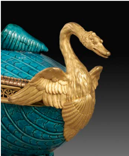
Pot-pourri vase (detail), gilt bronze by Pierre Gouthière, ca. 1770–75, Chinese hard-paste porcelain, eighteenth century, Musée du Louvre, Paris

November 16, 2016, through February 19, 2017