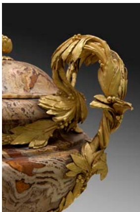
Vase (detail), gilt bronze by Pierre Gouthière, alabaster (probably eighteenth-century) probably carved by Augustine Bocciardi or Pierre-Jean-Baptiste Delaplanche, green marble, after a design by François-Joseph Bélanger, ca. 1770–75, private collection

In addition to the king and his mistress, Gouthière’s clientele comprised other wealthy members of the royal court. He produced some of his masterpieces for Louis-Marie-Augustin, the Duke of Aumont, who directed the Menus-Plaisirs et Affaires de la Chambre du Roi, an administrative body of the king’s household that managed the monarch’s personal effects and organized his entertainment, creating sets for theatrical productions and significant occasions such as marriages and funerals. The artists employed by the Menus-Plaisirs were free to develop new ideas without constraint, and their workshops were the locus for the forging of new fashions. The Duke of Aumont employed several artists from the Menus-Plaisirs (including Gouthière) to create objects for his personal cabinet of curiosities, housed in his sumptuous residence on Place Louis XV in Paris, now the Hôtel Crillon, Place de la Concorde. The cabinet was renowned among connoisseurs for its exquisite antique marbles, mounted porphyry, Asian porcelain, and gilt-bronze objects.