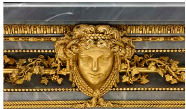
Side table (detail), bleu turquin marble supplied and carved by Jacques Adan, gilt bronze by Pierre Gouthière after a design by François-Joseph Bélanger and Jean-François-Thérèse Chalgrin, 1781, The Frick Collection, New York; photo: Michael Bodycomb

The Frick Collection's table—commissioned by the Duchess in 1781 and the inspiration for this exhibition—is certainly one of Gouthière's masterpieces. The mask at the center of its entablature is one of the most beautiful faces ever to have been created in gilt bronze. Its fine features follow the classical canon then in fashion, but instead of the rigidity or coldness of some models inspired by Greco-Roman examples, it is animated by eyes that look to the right under slightly lowered eyelids and a mouth that expresses a pensive self-confidence. Is it a young man or a beautiful woman? Gouthière's 1781 invoice