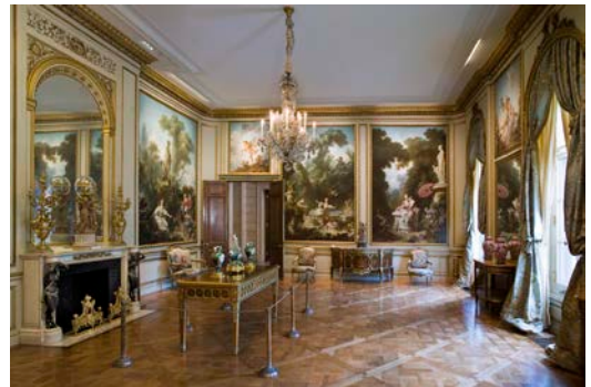
The Fragonard Room. The Frick Collection New York

Gouthière's commissions for Madame Du Barry include the knob for a French window that he made for the countess's pavilion of Louveciennes, one of France's most lavish eighteenth-century buildings, designed by the architect Claude-Nicolas Ledoux. Although it can no longer be appreciated in its original setting (the interior decoration was removed and sold to various collectors after the French Revolution), rare elements like this knob made for the pavilion's Salon en Cul-de-Four, as well as Jean-Honoré Fragonard's four panels