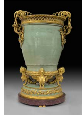
One of a pair of vases, gilt bronze by Pierre Gouthière after a design by François-Joseph Bélanger, 1782, eighteenth-century Chinese celadon hard-paste porcelain, porphyry, Musée du Louvre, Paris; photo: Joseph Godla

On a pair of Chinese vases (originally used as garden seats), Gouthière created for the Duke of Aumont mounts after a complex design by François-Joseph Bélanger, whose composition of arabesques, snakes, and harpies was considered the height of fashion in the 1780s. Gouthière's gilt-bronze interpretation of the architect's design shows his command of the medium. The snakes' backs are chased to create the illusion of small scales, while their bellies feature larger scales to imitate the skin of a live snake. Although bronze makers usually attached their mounts to porcelain by drilling holes in it, Gouthière again demonstrates his virtuosity by creating mounts that fit securely on the vases without piercing the fragile ceramics.