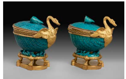
Two pot-pourri vases, gilt bronze by Pierre Gouthière, ca. 1770–75, Chinese hard-paste porcelain, eighteenth century, Musée du Louvre, Paris