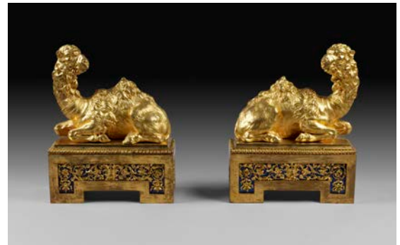
Pair of firedogs, Pierre Gouthière, 1777, gilt bronze and blued steel, Musée du Louvre, Paris

Barry is notorious, dividing the court of France between the pro-Marie Antoinette camp and those who preferred flattering Madame Du Barry. Gouthière managed to work for both. In 1777, he was asked to create several items for Marie Antoinette’s small Cabinet Turc at the Château de Fontainebleau. This prestigious commission included a pair of firedogs, a chimneypiece, a chandelier, a pair of wall lights, and a shovel and tongs with handles in the shape of “African heads.” Only the firedogs and chimneypiece (still in situ at the Château de Fontainebleau) have survived. A firedog is the decorative façade of an andiron, a metal support that holds burning wood in a fireplace. The design of these examples, in the shape of seated dromedaries, was in keeping with the oriental decorative theme of the Cabinet Turc, which was meant to transport the queen into a world of fantasy, sensuality, and refinement. The bases are adorned with an elegant arabesque frieze characteristic of the neoclassical style favored by the queen.