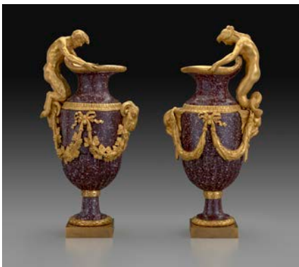
Pair of ewers, gilt bronze by Pierre Gouthière, ca. 1767–70, porphyry and gilt bronze, private collection