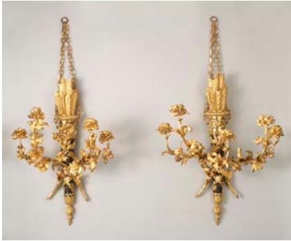
Pair of wall lights, gilt and patinate bronze by Pierre Gouthière after a design by François-Joseph Bélanger, ca. 1780, Musée du Louvre, Paris; photo: RMN-Grand Palais (Musée du Louvre) / Art Resource, NY / Martine-Beck Coppola

intermingle with a strand of pearls and branches of ivy. Both the branches and the veins of the ivy leaves are irregular, presenting an appearance so natural they seem to be actual specimens dipped in gold. Adding further refinement to the leaves, Gouthière employed a technique called dégraissage , or “paring back,” in which he reduced the thickness of the metal on edges and sides to render it more delicate. The leaves are matte gilded, while the fruit is burnished to emphasize the contrast between matte and shiny surfaces. The daring design (with some leaves overlapping others) and the lightness achieved through dégraissage are admirable.