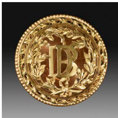
Knob for a French window, Pierre Gouthière after a design by Claude-Nicolas Ledoux, gilt bronze, ca. 1770, Musée des Arts décoratifs, Paris

depicting The Progress of Love , painted for the same room and now in The Frick Collection, attest to the pavilion's former glory. Each myrtle leaf, a symbol of the goddess Venus, is rendered in exquisite detail, forming a sort of lacework that contrasts with the smooth surface of the interlinked D and B , the royal mistress's initials. The knob alone confirms the recollections of the painter Élisabeth Vigée Le Brun, who, writing in the 1830s about her time spent in Du Barry's residence decades earlier, recalled that the "salon was ravishing ... the chimneypieces, the doors, everything was fashioned in the finest possible way; even the locks could be admired as masterpieces of the goldsmith's art."