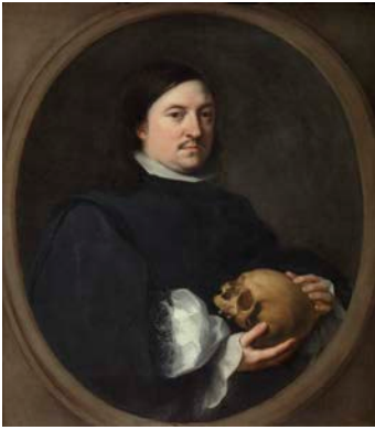
Bartolomé Esteban Murillo Nicolás Omazur , 1672 Oil on canvas 32 11/16 × 28 3/4 inches Museo Nacional del Prado, Madrid