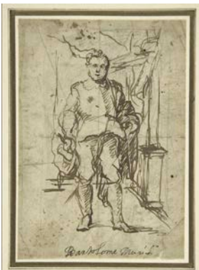
Bartolomé Esteban Murillo Standing Male Figure: Study for a Portrait , ca. 1660 Pen and brown ink over traces of black chalk underdrawing on off-white paper 5 5/8 × 4 inches The Metropolitan Museum of Art, New York; Rogers Fund, 1965