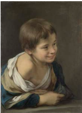
Bartolomé Esteban Murillo A Peasant Boy Leaning on a Sill , ca. 1675 Oil on canvas 20 1/2 × 15 3/16 inches The National Gallery, London; Presented by M.M. Zachary, 1826