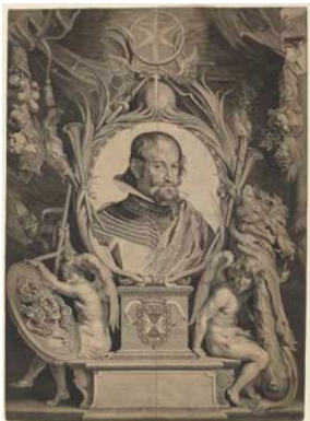
Paulus Pontius, after Diego Velázquez and Peter Paul Rubens Gaspar de Guzmán, Count-Duke of Olivares , ca. 1626 Engraving on paper 23 3/4 × 17 3/16 inches National Gallery of Art, Washington; Gift of the Estate of Leo Steinberg, 2011