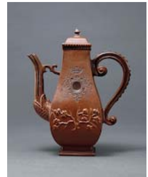
Coffeepot with Cover , Meissen stoneware, c. 1710–13, 2001.449; H: 6 1/9" (15.5 cm), The Arnhold Collection.

The early years at Meissen were exciting times of experimentation, not only with the formula for porcelain but also with shapes and decoration. Initially, many of the works produced were direct imitations of Japanese and Chinese objects in Augustus II’s famous collection. Others had European forms incorporating Asian decorative motifs. Because initially the manufactory had difficulty firing enamel colors, most of the wares were white or else were painted or gilded after firing. Böttger also had perfected a red stoneware, akin to Chinese Yixing ware, that could be fired at very high temperatures and that was sufficiently hard to be engraved, cut, and polished. Henry Arnhold’s collection is particularly rich in red stoneware objects produced at Meissen between 1710 and 1713. A handsome example from the first years of the factory is the Coffeepot with Cover which has a European form decorated with prunus blossoms in relief. The elaborate cartouche was made to be engraved with the royal owner’s armorials, but in this case it has been left blank.