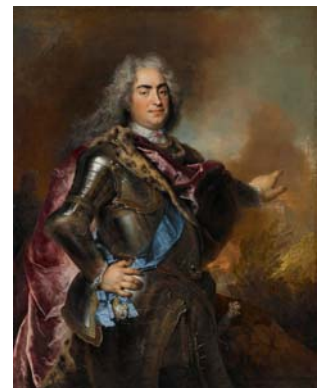
Nicolas de Largillière, French (1656-1746). Augustus the Strong, Elector of Saxony and King of Poland , ca. 1714-1715. Oil on canvas, 57 1/2 x 45 1/2 inches (146.1 x 115.6 cm). The Nelson-Atkins Museum of Art, Kansas City, Missouri. Purchase: Nelson Trust, 54-35.