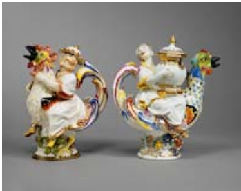
Cruet and Mustard Pot, Meissen porcelain, 1737–39, modeled by Johann Joachim Kändler, 1933.253; H: 7" (17.8 cm); 1933.254; H: 7 ½" (19.1 cm). The Arnhold Collection.