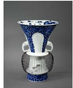
One of a Pair of Birdcage Vases, Meissen porcelain, after 1730, 2000.416; 20 1/4" (51.4 cm), The Arnhold Collection.