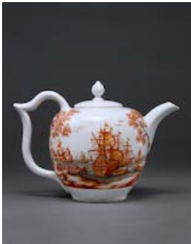
Teapot , Meissen porcelain, c. 1725–30, decoration attributed to Ignaz Preissler, c. 1725–30; 2001.468; H: 4" (10.2 cm), The Arnhold Collection

France, where the Chantilly porcelain manufactory soon would begin to produce groups in the same taste. The fact that the porcelain group is mounted on a French gilt-bronze base reinforces this supposition. Although the model for the group is not known, it may have been inspired by a Chinese sculpture in the king's collection.