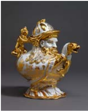
Teapot and Cover , Meissen porcelain, c. 1725–30, 1995.325; total, H: 6" (15.2 cm); without cover, to tip of handle, H: 5 3/8" (13.7 cm), The Arnhold Collection.

Although the formula for manufacturing true porcelain was developed in China by the sixth century, it remained a consuming mystery in the West until its discovery in 1708 by alchemist Johann Friedrich Böttger (1682–1719) under the patronage of August II (1670–1733), elector of Saxony and king of Poland. In 1710, the king established a royal manufactory outside of Dresden in the town of Meissen, and the porcelain created there has been known by that name ever since. Early Meissen porcelain and its decoration remained experimental into the 1740s. Examples from this period are particularly rare and have always been highly sought after.