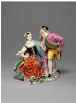
Pantalone and Columbine, Meissen porcelain, c. 1740, modeled by Johann Joachim Kändler, 1736–38; 2006.582; H: 6 5/8 in. (17 cm), The Arnhold Collection.