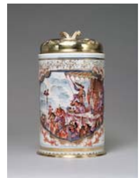
Mounted Tankard, Meissen porcelain, c.1723–34, decoration attributed to Johann Gregorius Höroldt, c. 1723–24, mounted in Augsburg, c. 1725, 2004.526; with lid, H: 7 ¼" (18.5 cm), The Arnhold Collection.