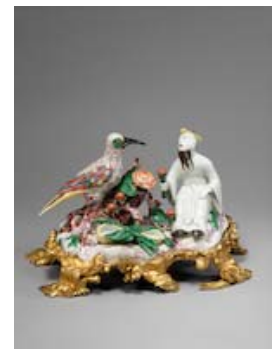
Mounted Figural Group , Meissen porcelain, c. 1728–30, model attributed to George Fritzsche, gilt-bronze mounts, probably French, 2005.558; H: 6" (15.2 cm); L: 9 3/4" (24.7 cm), The Arnhold Collection.

of the king and the court, diplomatic gifts of Meissen porcelain brought this distinctive European porcelain to the attention of royal collectors and connoisseurs outside Saxony, and a marketplace developed as well, particularly in France, with the marchands-merciers ordering figures and wares to satisfy local tastes. The charming Mounted Figural Group of a bearded Chinese man accompanied by a disproportionately large exotic bird, lemons, berries, and a flower (at right) may have been executed for export to