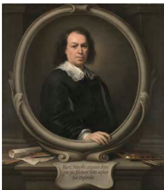
Murillo, Self-Portrait , ca. 1670, oil on canvas, The National Gallery, London; photograph ©The National Gallery, London

Murillo presents himself in a black jacket typical of the Spanish upper class. His sleeves are slashed and reveal his white shirt underneath, and he wears a rigid white collar, known in Spanish as a golilla . The painter's hair is long, over his shoulders, and he sports a fashionable moustache and slender goatee. No attributes or objects identify him as an artist; however, a long inscription in red letters declares him a famous painter. Because the inscription incorrectly gives his birth date as 1618 (instead of 1617) and states his death date, we know that it was added posthumously. Murillo's face is surrounded by a trompe l'oeil stone frame, a hollowed-out block, chipped and eroded by time. The block, in turn, is propped on top of a stone ledge. This fictive frame is unique in concept and is not found in any other work by the painter or by his followers.