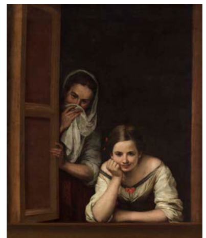
Murillo, Two Women at a Window, ca. 1655–60, oil on canvas, National Gallery of Art, Washington

urchins in the streets of Seville are particularly well known and, together with his Immaculates and other religious images, they remain the artist's signature works. Less familiar are a number of portraits, both full- and half-length, that Murillo painted of his patrons and friends. Biographers and scholars have paid little attention to this aspect of the artist's career, and this is the first exhibition dedicated exclusively to the subject. Murillo's first biographer, Antonio Palomino, described the artist in 1724 as "an eminent portrait painter," although only about fifteen portraits by or attributed to him (including the two self-portraits) have survived. Five of these are included in