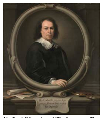
Murillo, Self-Portrait , ca. 1670, oil on canvas, The National Gallery, London

Murillo presents himself in a black jacket typical of the Spanish upper class. His sleeves are slashed and reveal his white shirt underneath, and he wears a rigid white collar, known in Spanish as a golilla . The painter's hair is long, over his shoulders, and he sports a fashionable moustache and slender goatee. No attributes or objects identify him as an artist; however, a long inscription in red letters declares him a famous painter. Because the inscription incorrectly gives his birth date as 1618 (instead of 1617) and states his death date, we know that it was added posthumously. Murillo's face is surrounded by a trompe l'oeil stone frame, a hollowed-out block, chipped and eroded by time. The block, in turn, is propped on top of a stone ledge. This fictive frame is unique in concept and is not found in any other work by the painter or by his followers.