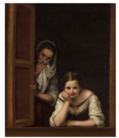
Murillo, Two Women at a Window, ca. 1655–60, oil on canvas, National Gallery of Art, Washington

urchins in the streets of Seville are particularly well known and, together with his Immaculates and other religious images, they remain the artist's signature works. Less familiar are a number of portraits, both full- and half-length, that Murillo painted of his patrons and friends. Biographers and scholars have paid little attention to this aspect of the artist's career, and this is the first exhibition dedicated exclusively to the subject. Murillo's first biographer, Antonio Palomino, described the artist in 1724 as "an eminent portrait painter," although only about