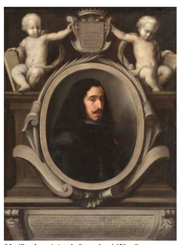
Murillo, Juan Arias de Saavedra , 1650, oil on canvas, Collection Duchess of Cardona

longer grasps the frame. In addition, the oval frame in the engraving is narrower and higher than the one in the painting, the painter's attributes have been omitted from the ledge, and the inscription is now presented on a tablet rather than a cartouche. With these modifications, the print evokes the tombs and monuments found in European churches, in which carved busts were placed in niches over inscriptions commemorating the life of the deceased.