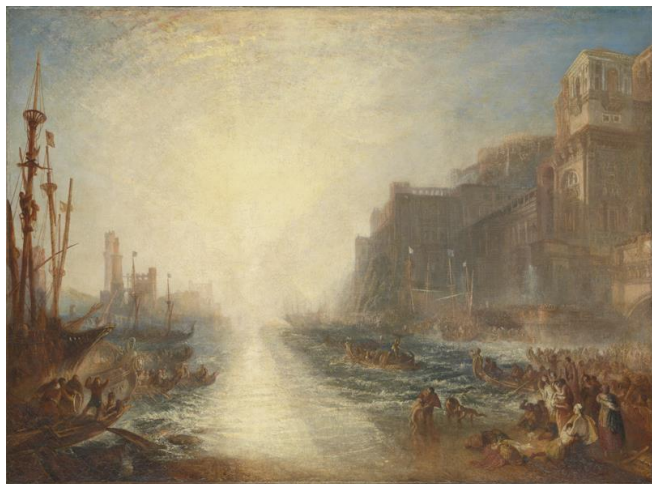
J.M.W. Turner, Regulus , exhibited 1828, reworked and exhibited 1837, oil on canvas, Tate; Accepted by the nation as part of the Turner Bequest 1856; © Tate, London 2016

Following Dieppe , Cologne , and Brest , Turner returned to the motif of the port in the late 1820s, now as a setting for subjects from the ancient world. The theme of the rise and decline of civilizations had long preoccupied Turner, and his second trip to Italy, in 1828, reinvigorated his love of antiquity. The three ancient ports included in the exhibition complement his modern views, works rooted in on-the-spot observation of the setting and local populace and filtered through the artist's imaginative recollection. In his classical harbors, accounts from ancient history are the departure points for the works, which Turner filled with details of everyday life that lend the scenes the immediacy of his modern ports.