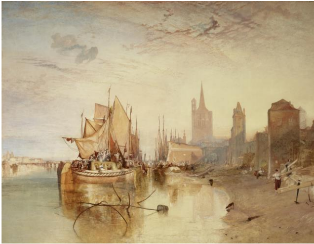
J.M.W. Turner, Cologne, the Arrival of a Packet-Boat: Evening, exhibited 1826, oil on canvas, The Frick Collection

In Dieppe's companion piece, Cologne, the Arrival of a Packet-Boat: Evening , Turner turns his attention to the historic city and pilgrimage center on the banks of the Rhine, replacing the sun-filled harbor in Dieppe with an evening scene in which life appears suspended in time. The deep recession of space that characterizes Dieppe is blocked in Cologne by the two packet boats that approach the shore. The Claudian reference of the former work is replaced here by allusion to the peaceful, domestic river scenes of the Dutch masters, in particular, Aelbert Cuyp. Light again establishes the emotional register of the painting, conveying a mood of reverie through the