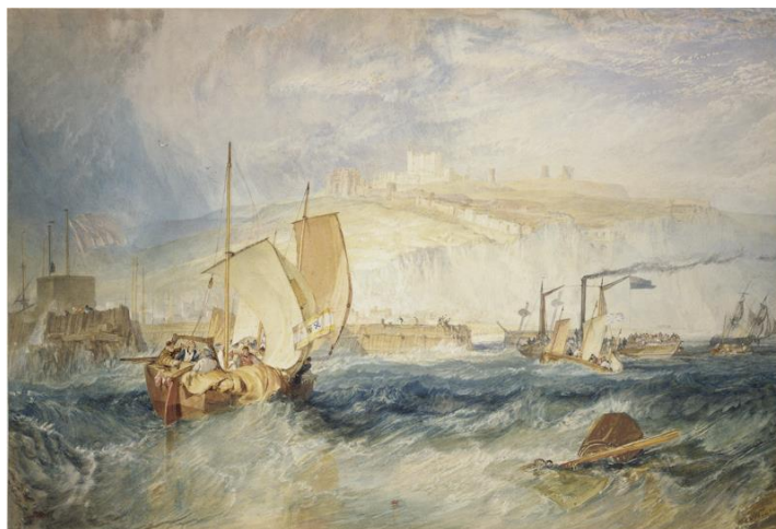
J.M.W. Turner, Dover Castle from the Sea, for Marine Views , 1822, watercolor and gouache on paper, Museum of Fine Arts, Boston; Bequest of David P. Kimball, in memory of his wife, Clara Bertram Kimball, © 2017 Museum of Fine Arts, Boston

The exhibition includes some two dozen watercolors depicting picturesque ports on the British coast and up and down its rivers, as well as images from northern France and the Rhineland, along with a selection of prints. Showcasing the diversity and beauty of the English landscape and seascape, Turner depicted every type of port: naval strongholds, fashionable resorts, industrial harbors, major anchorages in large cities, and remote river landings, some seen from the shore and others looking back from the water. He embellished his images with historical references and allusions to contemporary issues and expressed an