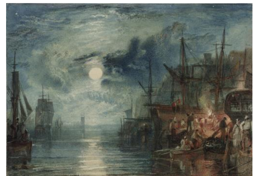
J.M.W. Turner, Shields, on the River Tyne , for The Rivers of England , 1823, watercolor on paper, Tate; Accepted by the nation as part of the Turner Bequest 1856

Whether portraying the ancient world or encapsulating contemporary life in a specific region, Turner returned to this time-honored theme to explore the relationship of past and present and, conscious of his own place in