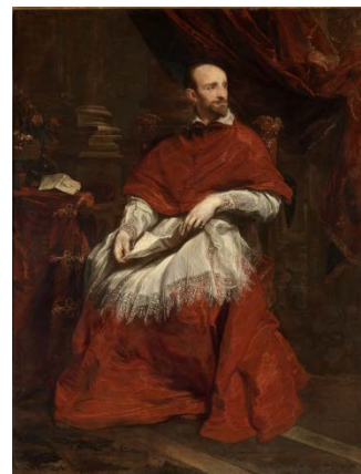
Anthony van Dyck (1599–1641), Cardinal Guido Bentivoglio , 1623, oil on canvas, Galleria Palatina, Palazzo Pitti, Florence

Born in 1599 to a family of patrician merchants, Anthony van Dyck endured a childhood marred by his mother's early death and his father's financial instability. In 1610, he enrolled as an apprentice to the painter Hendrick van Balen, although Peter Paul Rubens, Antwerp's most celebrated artist, would exert a far greater influence on his development. By his late teens, the young Van Dyck was already assisting Rubens on large-scale commissions. A brief sojourn in England followed by a stay of roughly six years in Italy cemented his emergence as a mature painter in his own right, familiar with the great masters of the Italian Renaissance and the most sophisticated courts of Europe. One of the most important loans in the exhibition was painted during this period: Van Dyck's 1623 portrait of Cardinal Guido Bentivoglio, from the Galleria Palatina at the Palazzo Pitti in Florence, at right. In the Baroque period, Van Dyck's depiction of Bentivoglio was much emulated and became the benchmark for any portrait of a prince of the Church. Its exclusive trip to the Frick marks only the second time in the painting's history that it has left Italy.