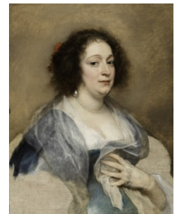
Van Dyck, Portrait of a Woman , ca. 1640, oil on canvas, Speed Art Museum, Louisville; Museum Purchase, Preston Pope Satterwhite Fund

Van Dyck's singularity is most apparent in his approach to preparing a portrait, and initial sketches and unfinished paintings compose one of the major themes of the show. Portrait drawings by his contemporaries, including Peter Lely and Jacob Jordaens, will highlight the distinct way he created his celebrated portraits. Whereas many artists made detailed studies of a sitter's face before beginning work on a painting, Van Dyck preferred rough sketches that mapped a sitter's pose but left many details unresolved. He would then usually paint the sitter