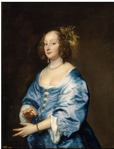
Anthony van Dyck (1599–1641), Mary, Lady van Dyck, née Ruthven , ca. 1640, oil on canvas, Museo Nacional del Prado

Anthony van Dyck (1599–1641), one of the most celebrated and influential portraitists of all time, enjoyed an international career that took him from his native Flanders to Italy, France, and, ultimately, the court of Charles I in England. Van Dyck's elegant manner and convincing evocation of a sitter's inner life—whether real or imagined—made him the favorite portraitist of many of the most powerful and interesting figures of the seventeenth century. His sitters—poets, duchesses, painters, and generals—represent the social and artistic elite of his age, and his achievement in portraiture marked a turning point in the history of European painting. Van Dyck: The Anatomy of Portraiture , on view only at New York's Frick Collection, looks comprehensively at the artist's activity and process as a portraitist. It is also the first major exhibition devoted to his work to be held in the