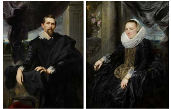
Van Dyck (1599–1641), Frans Snyders, ca. 1620, oil on canvas, The Frick Collection; Henry Clay Frick Bequest; Van Dyck, Margareta de Vos, ca. 1620, oil on canvas, The Frick Collection; Henry Clay Frick Bequest

In addition to showcasing notable works from European collections, Van Dyck: The Anatomy of Portraiture will also shine a spotlight on important paintings by Van Dyck from American private and public collections, many of which have not been included in previous exhibitions on the artist. These paintings are a legacy of the longtime fascination that Van Dyck has exerted on American collectors, including Henry Clay Frick, who acquired no fewer than eight