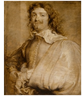
Van Dyck, Adriaen Brouwer , ca. 1634, oil on panel, The Duke of Buccleuch and Queensberry, KBE, Boughton House, Northamptonshire

cheekbones, and forehead, yielding to loose crosshatching in areas of greater shadow. Calligraphic lines, meanwhile, convey Snyder's nonchalantly arranged hair and upturned mustache. Such a minimal etching was intended to appeal to the most sophisticated collectors, but Van Dyck also collaborated with highly skilled professional engravers to create more traditional prints for wider distribution. To assist these engravers, Van Dyck prepared both drawings and exquisite grisailles, or gray-scale oil sketches. In the exhibition, four of these grisailles, one of which is shown at right, will demonstrate Van Dyck's unusual mastery of this refined medium.