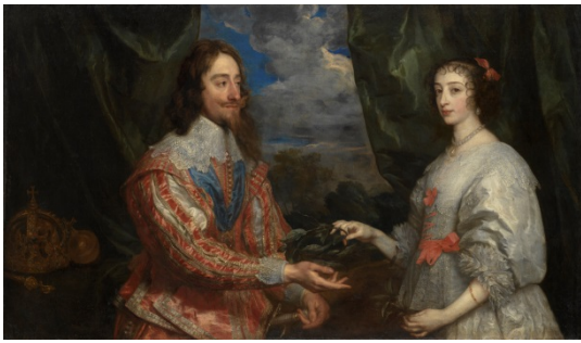
Van Dyck, Charles I and Henrietta Maria Holding a Laurel Wreath , 1632, oil on canvas, Arcibiskupský zámek a zahrady v Kroměříži, Kroměříž

In 1632, Van Dyck was appointed principal painter to Charles I of England. The portraits he produced over the following decade, before his premature death in 1641, are among his most celebrated and feature heavily in the exhibition. Included in the exhibition is a horizontal portrait of Charles I and his queen Henrietta Maria, now in the collection of Archbishop Castle and Gardens, Kroměříž, The Czech Republic. This remarkable canvas has never before traveled to the United States. Coming from the National Gallery of Art,