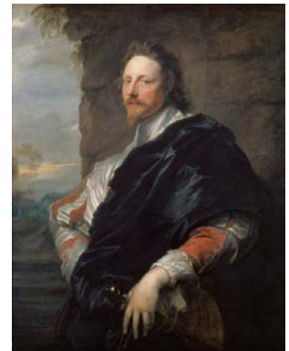
Van Dyck, Nicholas Lanier , ca. 1628, oil on canvas, Kunsthistorisches Museum, Vienna

his curls, his elegant hands, and his almost supercilious expression. Nonetheless, the artist made a number of changes in the final composition: instead of holding out a glove in his right hand, Lanier's arm is akimbo, the hand tucked invisibly at his side. Less obviously, Van Dyck removed a lock of hair to leave Lanier's temple exposed. These alterations indicate how Van Dyck continued to think through his composition as he transitioned from preparatory drawing to canvas. Remarking on the artist's meticulous process, Lanier told the painter Peter Lely that he "sat seven entire days" for his portrait, but "was not permitted so much as once to see it till [Van Dyck] had perfectly finished the face to his own satisfaction." Such anecdotes combine with the physical evidence of Van Dyck's works to allow for the exhibition's reconstruction of the artist's working method.