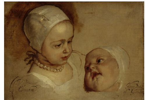
Van Dyck, The Princesses Elizabeth and Anne, Daughters of Charles I , 1637, oil on canvas, Scottish National Portrait Gallery, Edinburgh; purchased with the aid of the Heritage Lottery Fund, the Scottish Office, and the Art Fund 1996

United States in more than twenty years. Through approximately one hundred works, the show explores the versatility and inventiveness of a portrait specialist, the stylistic development of a draftsman and painter, and the efficiency and genius of an artist in action. Organized chronologically around the different geographic chapters of Van Dyck's career, the exhibition documents the artist's development from an ambitious young apprentice into the most sought-after portrait painter in Europe. The show also includes a small selection of comparative works by