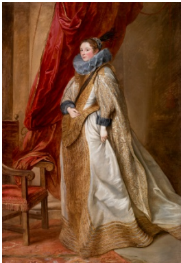
Van Dyck, Genoese Noblewoman, ca. 1625–27, oil on canvas, The Frick Collection; Henry Clay Frick Bequest

paintings by the artist. Among these is the portrait of Frans Snyders, a fellow painter and close artistic collaborator, purchased in the summer of 1909 by Frick, who also acquired that same year the pendant portrait of Snyders's wife, Margareta de Vos. Painted about 1620 when the artist was roughly twenty years old, the two portraits (above) reveal the prodigy's startling talent, expressed in likenesses that combine supreme elegance with a subtle element of melancholy. Other Frick-owned works included in the exhibition will be the full-length canvas Lady Anne Carey, Later Viscountess Claneboye and Countess of Clanbrassil , and the recently conserved Portrait of a Genoese Noblewoman , at left.