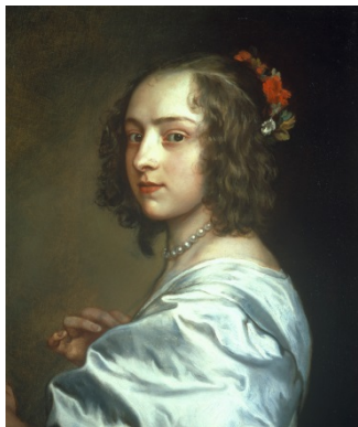
Van Dyck, Margaret Lemon , ca. 1638, private collection, New York

Van Dyck used portraiture to represent the very pinnacle of contemporary society, but it also provided him with a vehicle to explore intimate relationships and his own identity. The exhibition will include portraits of Van Dyck's wife, Mary (page 1), as well as the woman believed to have been his mistress, the courtesan Margaret Lemon, at left.