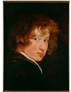
Van Dyck, Self-Portrait , ca. 1613–15, oil on panel, Gemäldegalerie der Akademie der bildenden Künste, Vienna

Visitors to Van Dyck: The Anatomy of Portraiture will have an unprecedented chance to immerse themselves in that achievement.