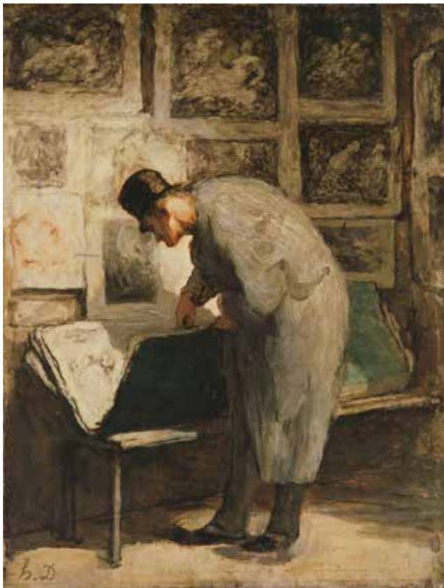
Honoré Daumier, The Print Collector , c. 1860. Oil on panel. Philadelphia Museum of Art. Purchased with the W. P. Wiltach Fund, 1954